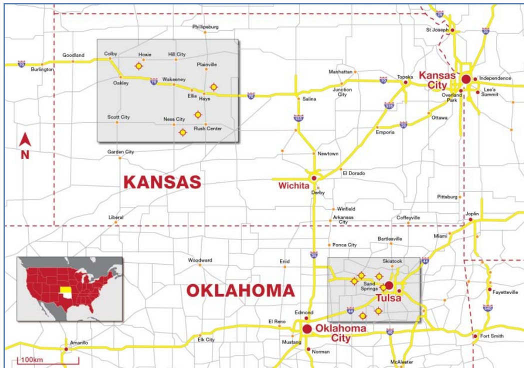
Figure 3 Location of Oil and Gas Interests held by AusTex Oil Limited