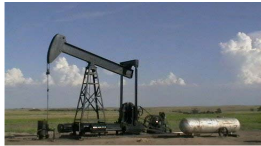
Figure 2 & 3 Clark #1 and Oil Storage Battery - Cooper Project