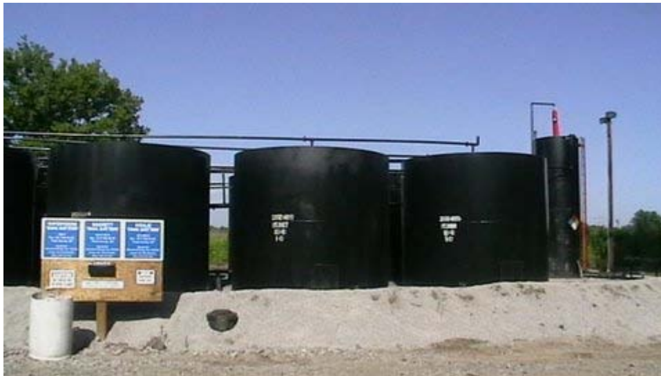
Figure 1 Mayo Moore Oil Storage Battery