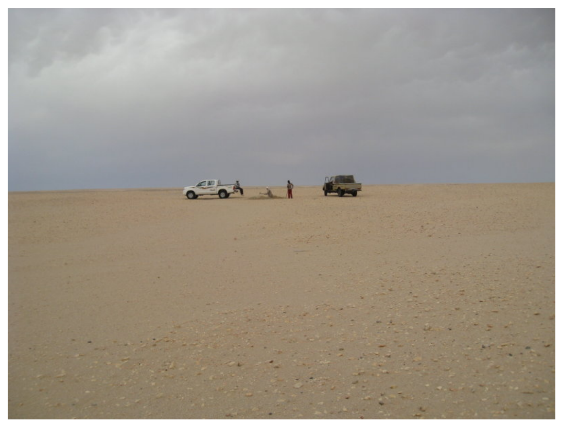
Typical terrain in the Groupe Azizi permits