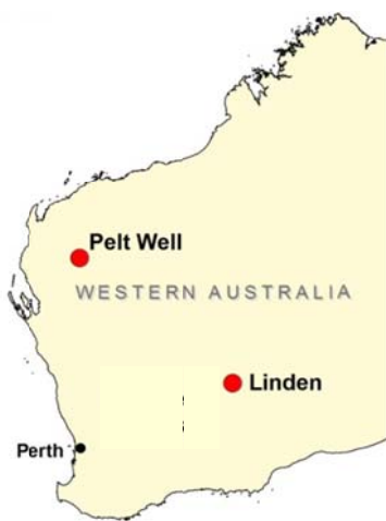
Location of the WA projects.

Power Resources' portfolio of Western Australian projects comprises: