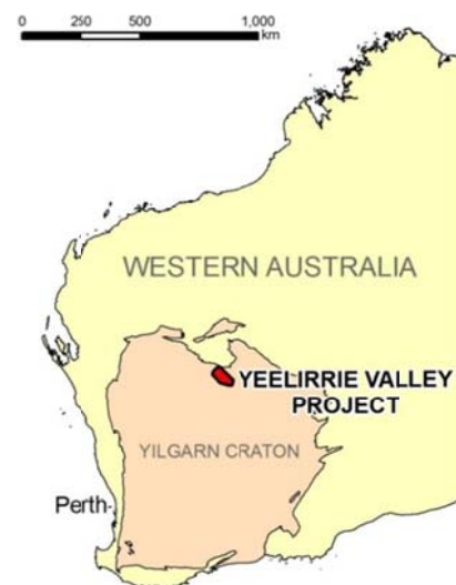
Figure 3 – Location of the Yeelirrie Valley project

In light of current poor market conditions, no field work was conducted this quarter.