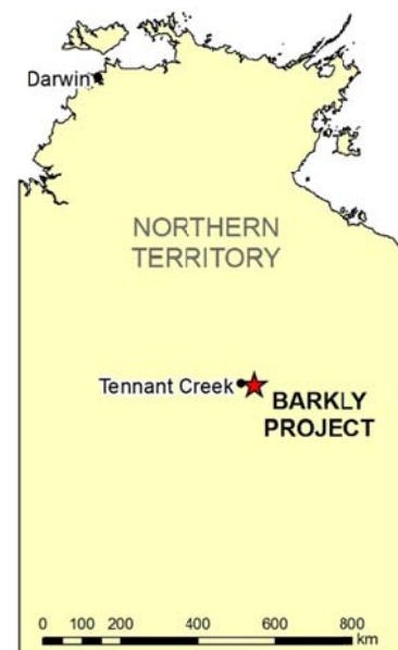
Figure 1 – Location of the Barkly Cu-Au project

During the quarter, an audit of all data was completed, and the data standardised and imported into the Company's databases. Work is presently underway to model the entire Barkly project in three dimensions. Once modelled, planned drill hole locations and orientations will be finalised in preparation for the forthcoming reverse circulation drill program.