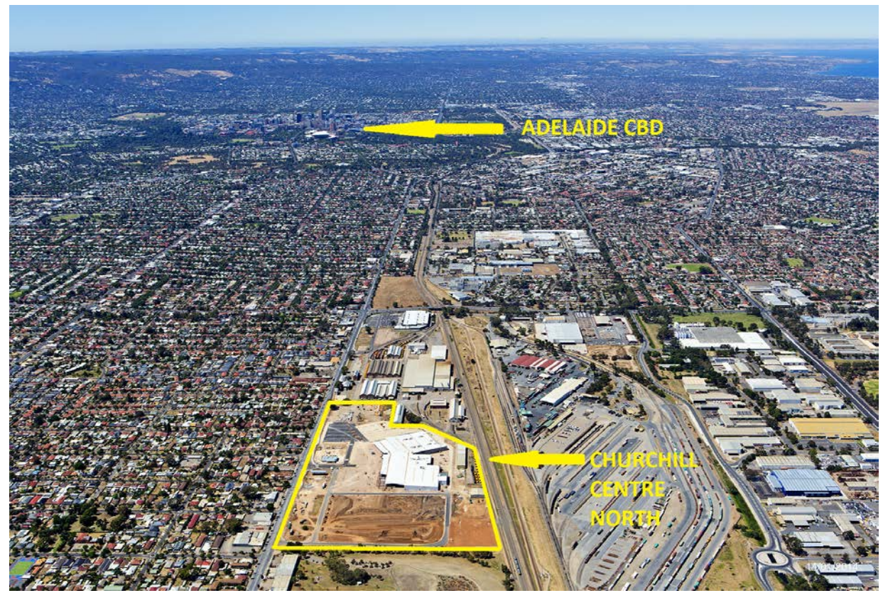
Construction and site earthworks as at 14 January 2014

During the half-year, the Company agreed conditional terms with a major international supermarket retailer to anchor Stage 2 of the Churchill Centre North project. This second stage of the Centre will add another 4,500 sq.m (approx.) of retail to the Centre, and is expected to commence construction in 15 months' time, with a completion date of October 2015. Legal documentation on the agreed terms commenced during the half-year.