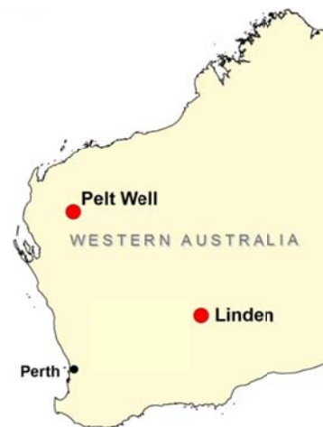
Location of the WA projects.

Linden (Good Hope) is located in the Eastern Goldfields of Western Australia. Government records show that 30 tons of ore yielded 1 oz (~31 grams) of gold per ton from a structure around 1 metre thick. Historic sampling of quartz-pyrite altered rocks from local waste dumps recorded grades of up to 16 g/t Au. Linden (Good Hope) is contained by Prospecting Licence 39/5062 and is located in the Linden mining district some 120 km southeast of the town of Leonora.