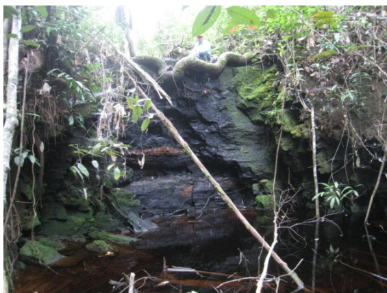
Figure 3 – Coal outcrops in Jatenergy’s CSB lease

Figure 2 illustrates how the Main Seam has been best defined in the southern portion of the KR lease and is likely to extend into CSB as well.