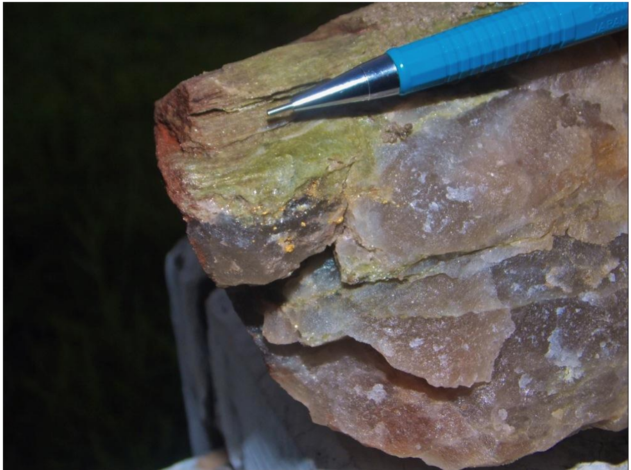
Figure 2. Visible gold from the Cascavel exploration decline.