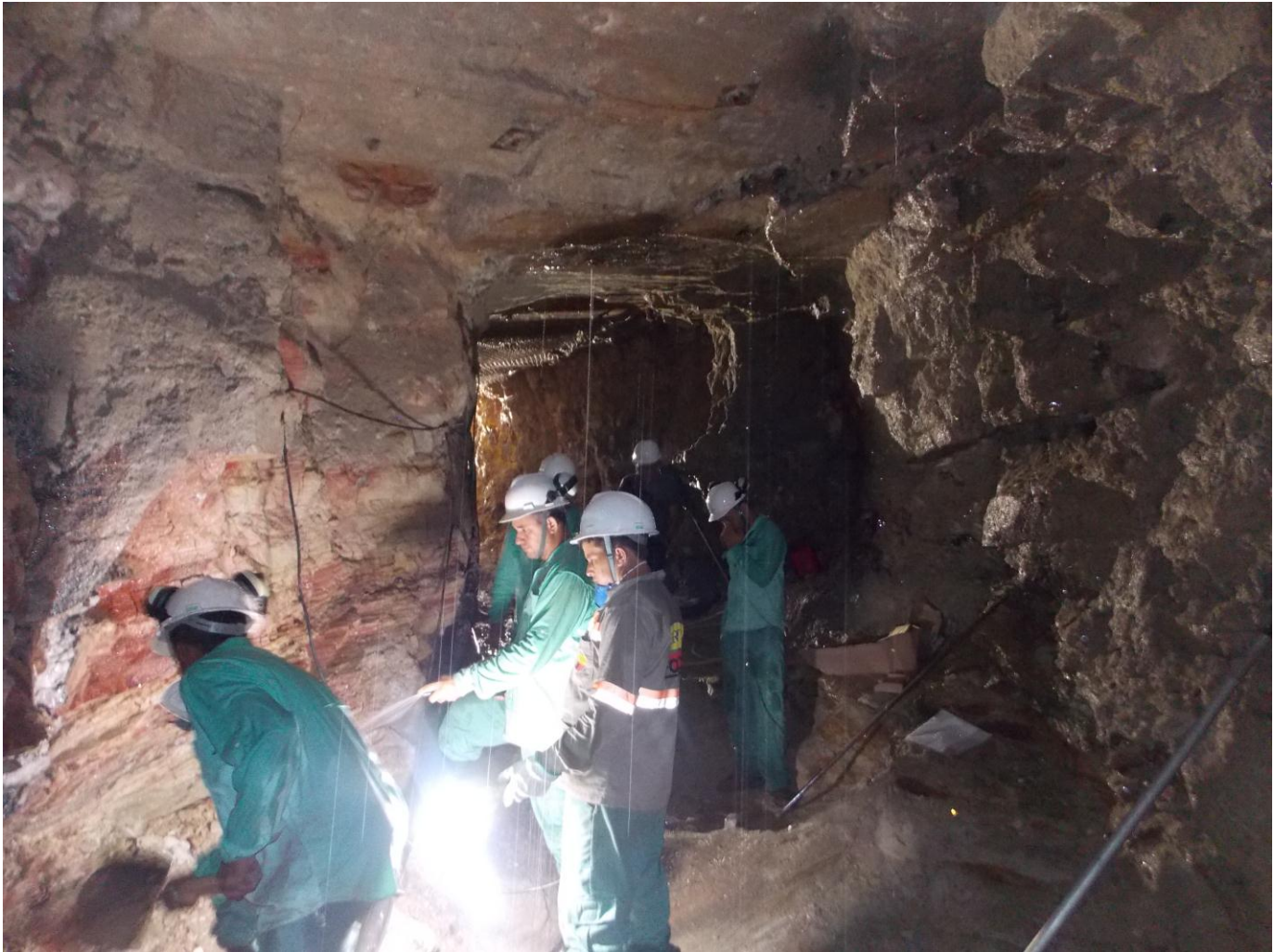
Figure 3. Cleaning the face of the exploration decline ahead of sampling.