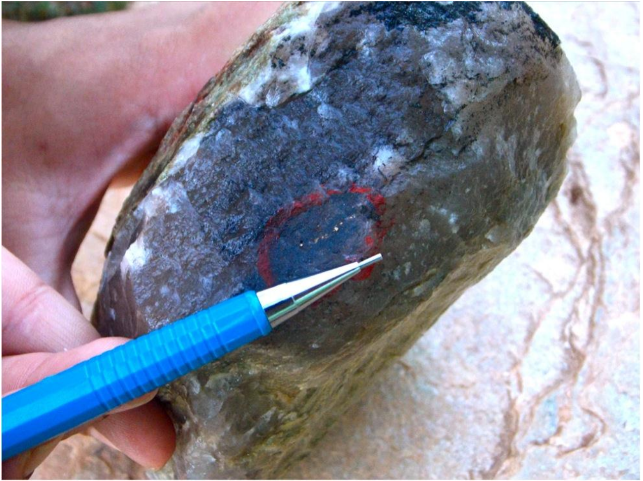
Figure 1. Visible gold from the Cascavel exploration decline.