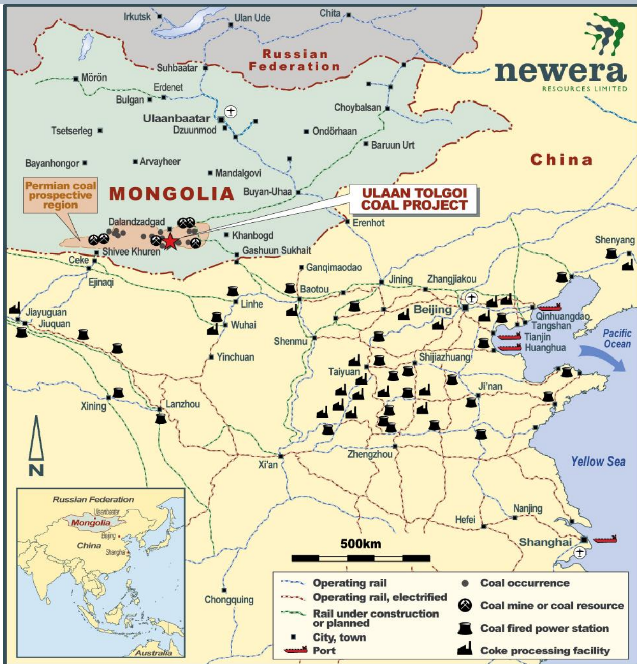
Figure 1: Newera Resources Ltd, Mongolian coal project location plan showing the Ulaan Tolgoi project location, the interpreted limits of the Permian coal prospective South Gobi Basin along with transport infrastructure and Chinese coal usage facilities.