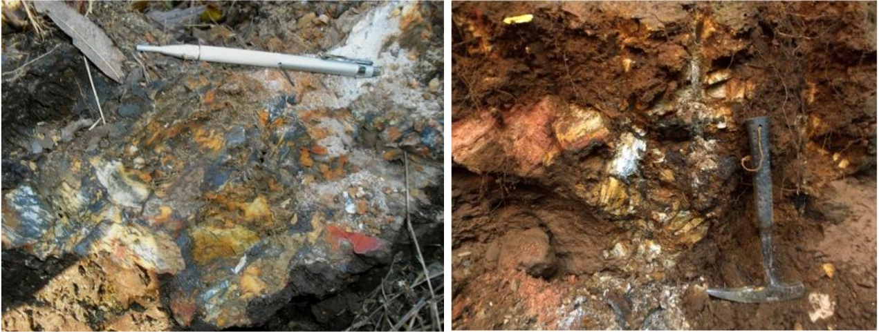
Figure 1. Sampling of this breccia outcrop showing hematite alteration returned grades of 4,234 g/t silver and 0.3% Copper.