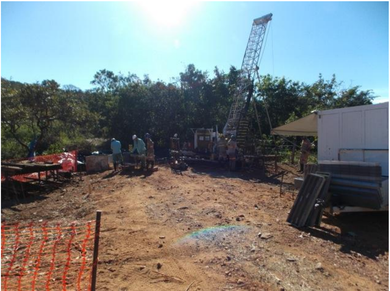
Figure 2. Drill rig on site at Tinteiro South.