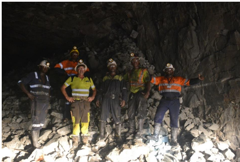
Photo 1 - Segala ore pile in first stope

Ore is being hauled from the mine in 30 tonne trucks to a ROM pad and then hauled by 18 tonne trucks to the Tabakoto plant, 5 km to the southeast. The average planned grade is 3.70 g/t.