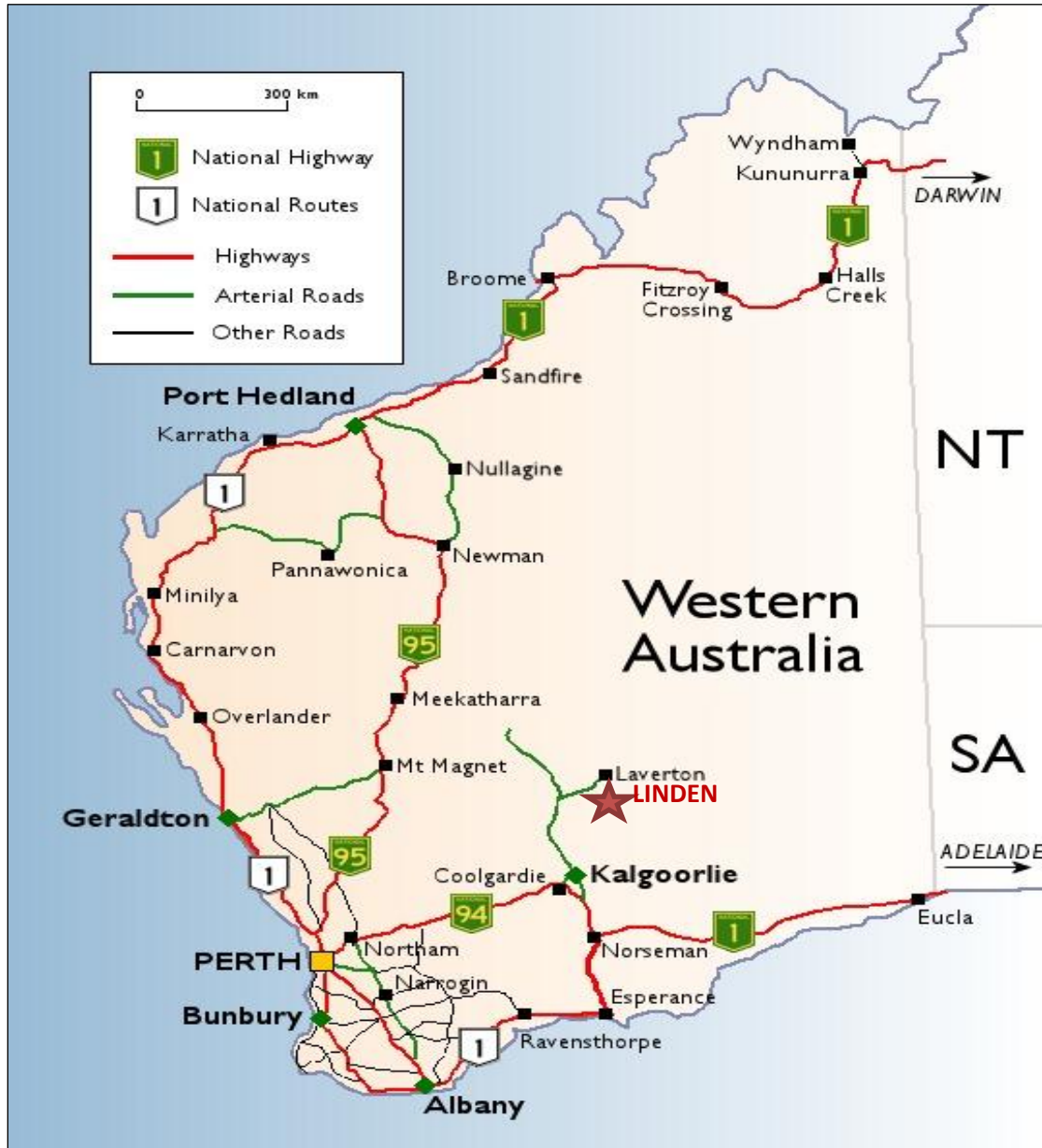
Figure 1: Linden Project Location