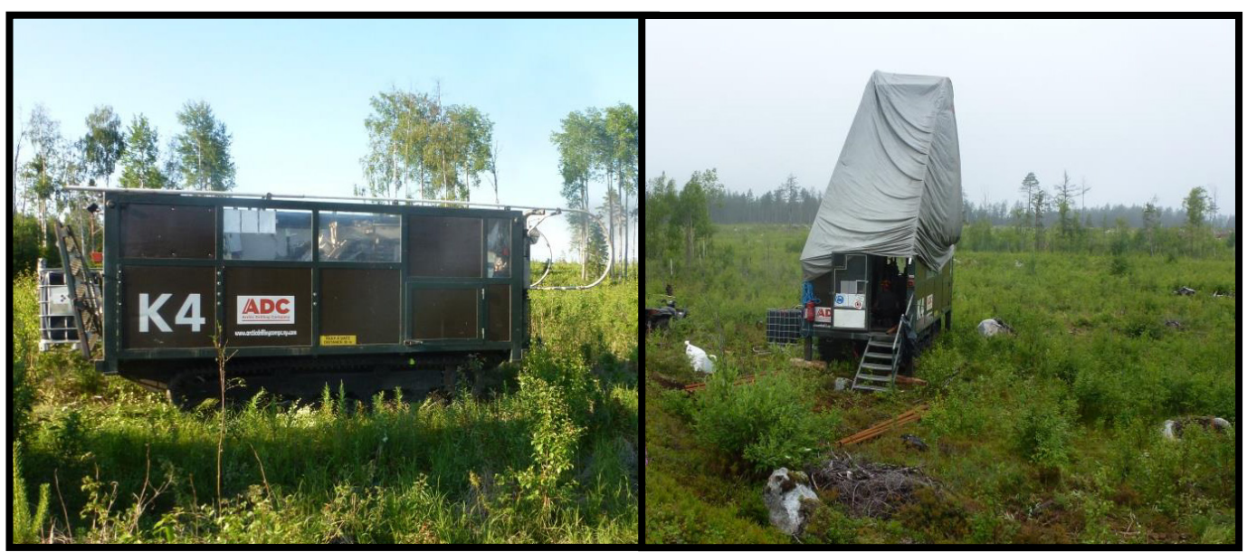
Figures 1 and 2. Small track diamond drill rig being utilised by Boss Resources for the current drill program with minimal footprint and impact on the surrounding environment.