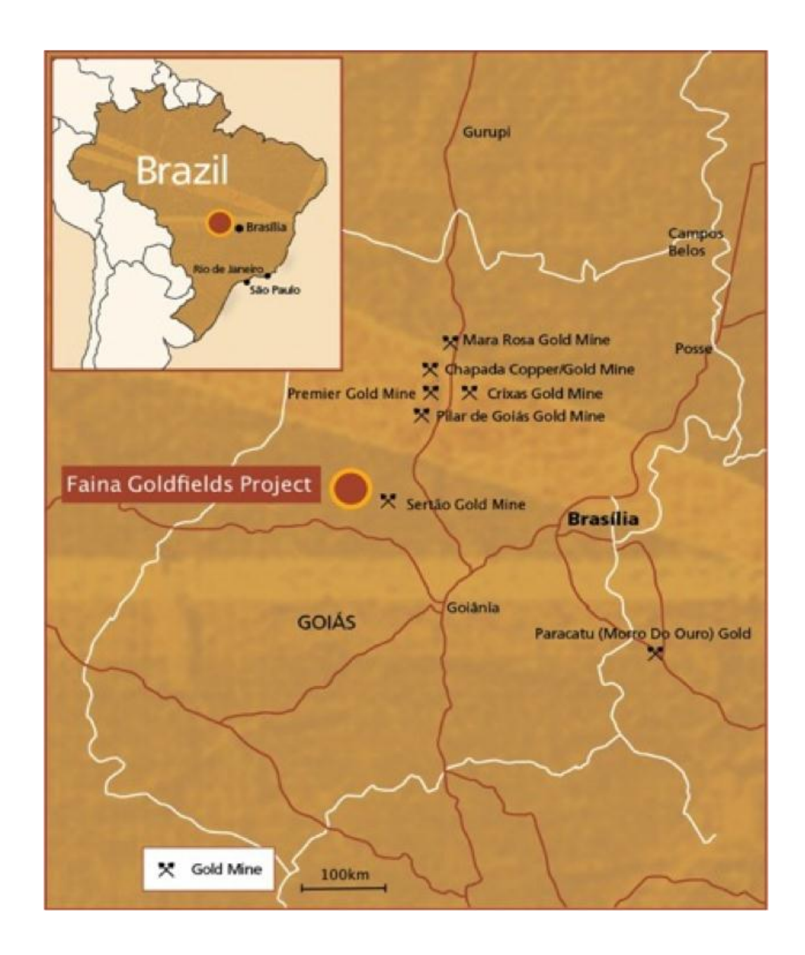
Figure 2. Location of Orinoco's Faina Goldfields Project (including Cascavel) relative to the states gold mines, including Cleveland's Premier Gold Mine.