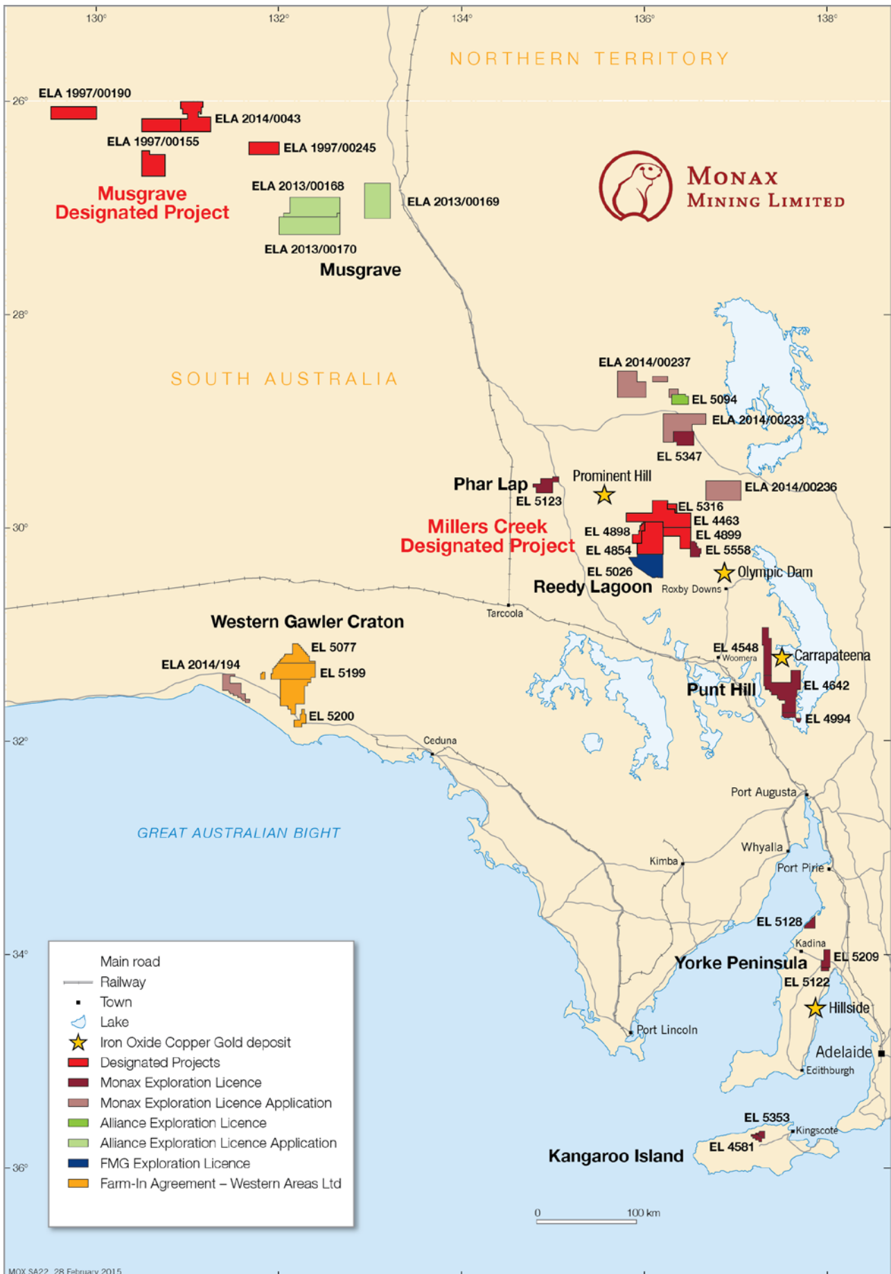
Figure 1. Location of Monax Projects including the Millers Creek Designated Project.