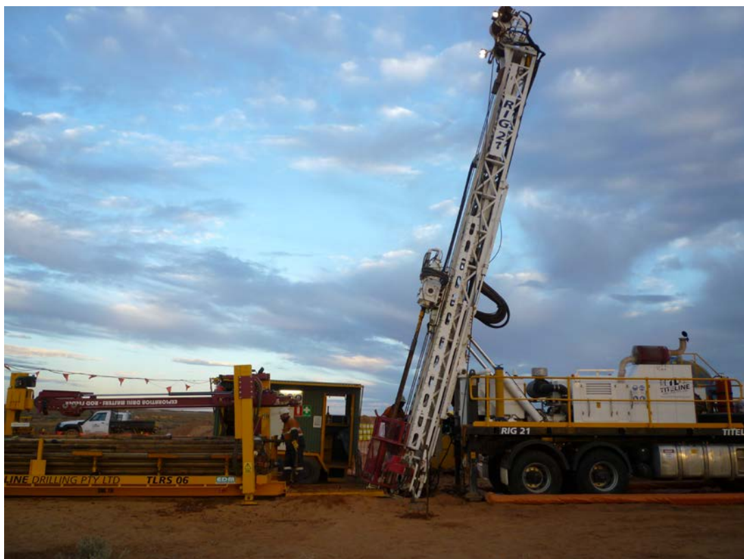
Plate 1. Drill rig on site at Oliffes Dam target.