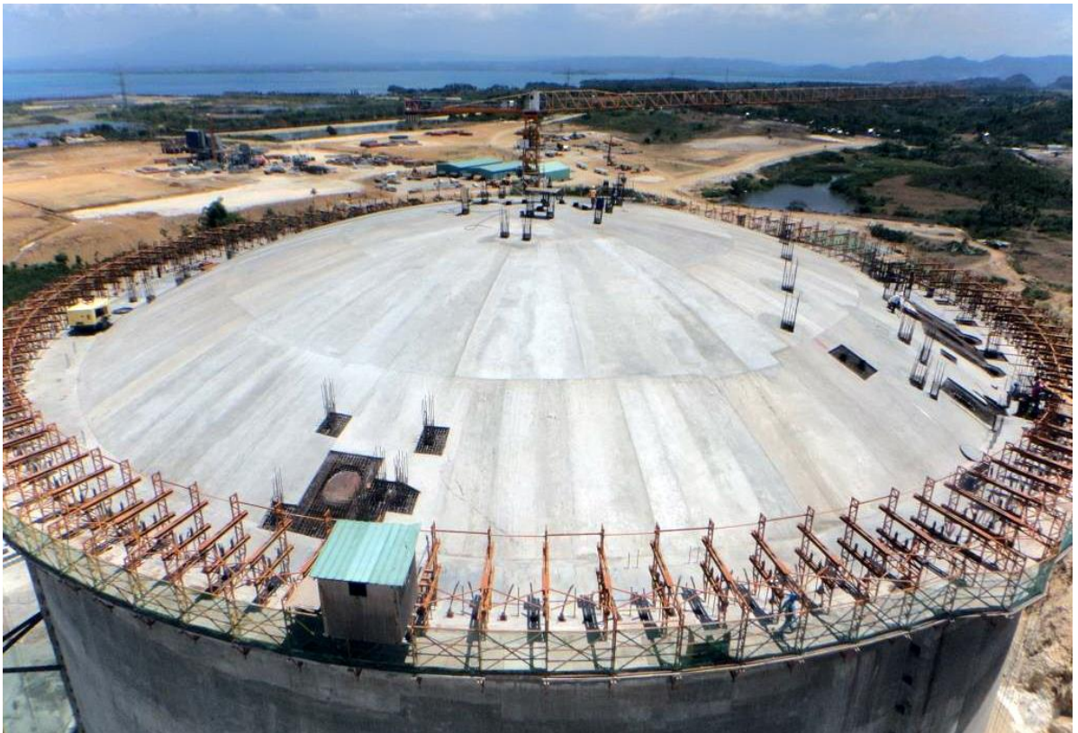
Construction of LNG Storage Tank Roof Dome