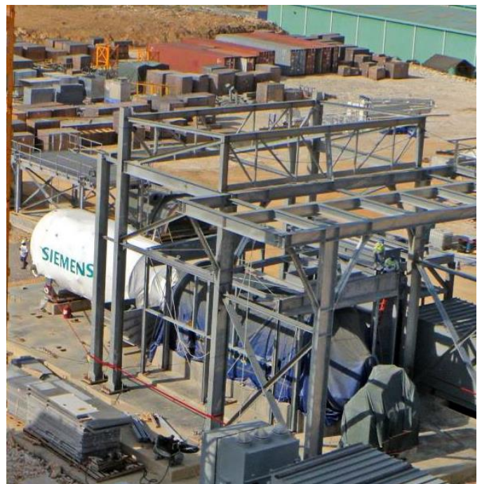
Construction of Power Station