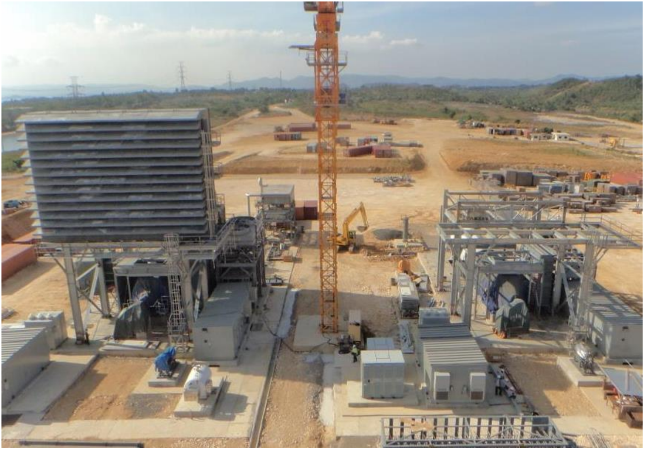
Gas Turbine 1