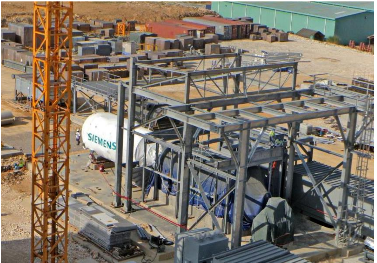
Construction of Power Station