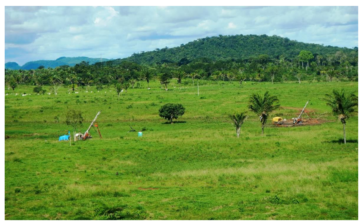
View looking along the strike of Pedra Branca East