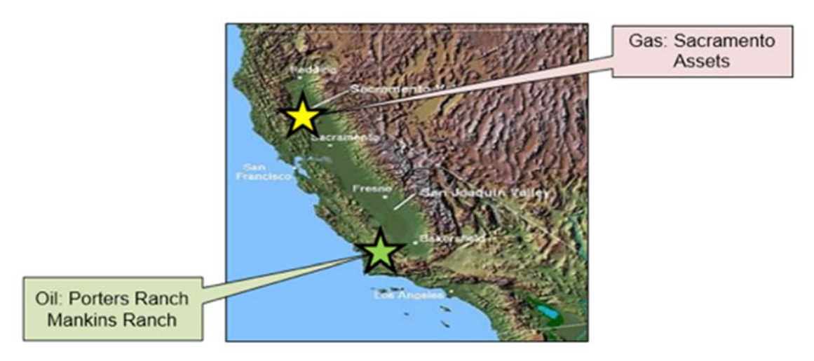
AOC's oil and gas assets, onshore California