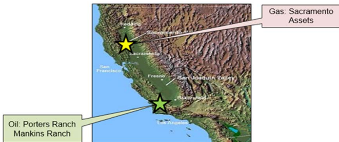
AOC's oil and gas assets, onshore California