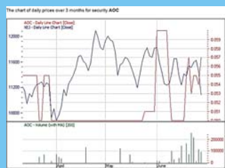
AOC 3 month Share Price Chart Compared with ASX Energy Index

Perth Office: Level 2 , 210 Bagot Road, Subiaco WA 6008 Australia