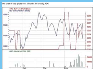
AOC 3 month Share Price Chart Compared with ASX Energy Index

Perth Office: Level 2, 210 Bagot Road, Subiaco WA 6008 Australia