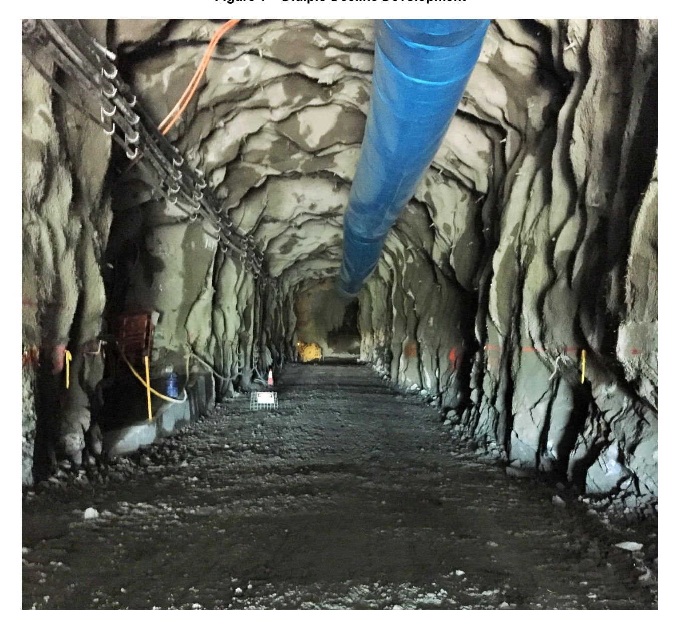
Figure 1 – Didipio Decline Development