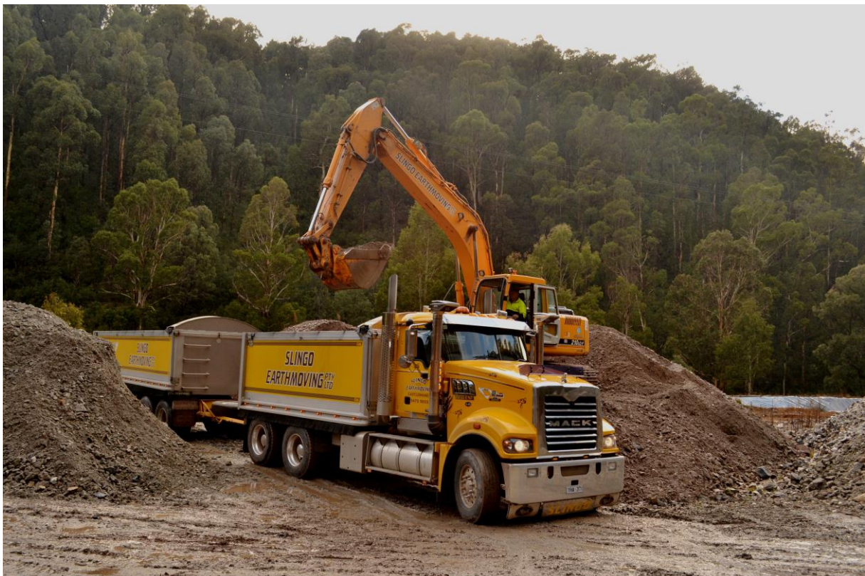
Figure 2. Loading of ore at A1 Mine ROM Pad

Subsequent to the end of the quarter, transport of ore from the A1 Mine to the Maldon Treatment Plant commenced on 22 nd July 2015. This ore is derived from stockpiles of underground reef development at the A1 Mine. There is currently 2000 tonnes available for transport and processing, with underground stoping activity continually adding to the stockpiles.