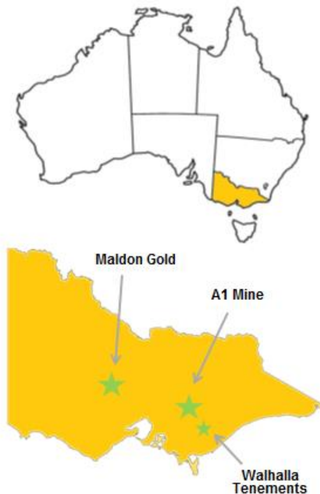
Figure 3: Location of Projects

As announced on 29 August 2014, the Company has entered into an option agreement with Orion Gold NL (ASX:ORN) to acquire Orion Gold's Walhalla tenements.