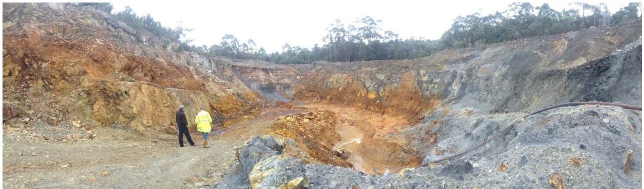
Figure 2: View of Granville East pit looking south

The Twelve Mile Creek processing plant is located 21km from Zeehan with access to the Granville East open pit via Heemskirk Road (bitumen). The processing plant comprises a crusher, ball mill and tin dressing (including jigs, tables, magnetic separators and flotation). The Twelve Mile Creek processing plant is currently approved to treat 1000tpa but McDermott Mining has commenced the process to increase the approved treatment rate to 50,000tpa.