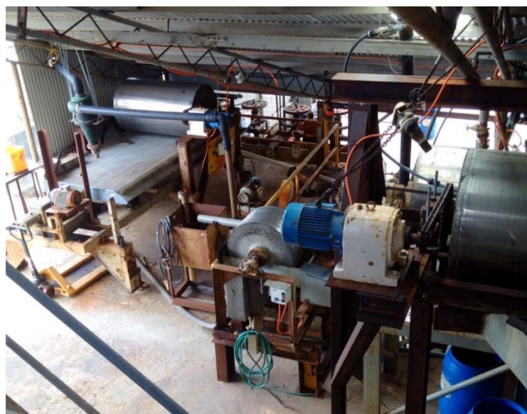
Figure 3: Twelve Mile Creek processing plant with table/magnetic separation for removal of magnetite.

depth 4 . Limited work has been undertaken at the North Heemskirk Deep Lead. Whilst Aus Tin Mining does not have any immediate plans to exploit the alluvial prospects they do represent future exploration targets.