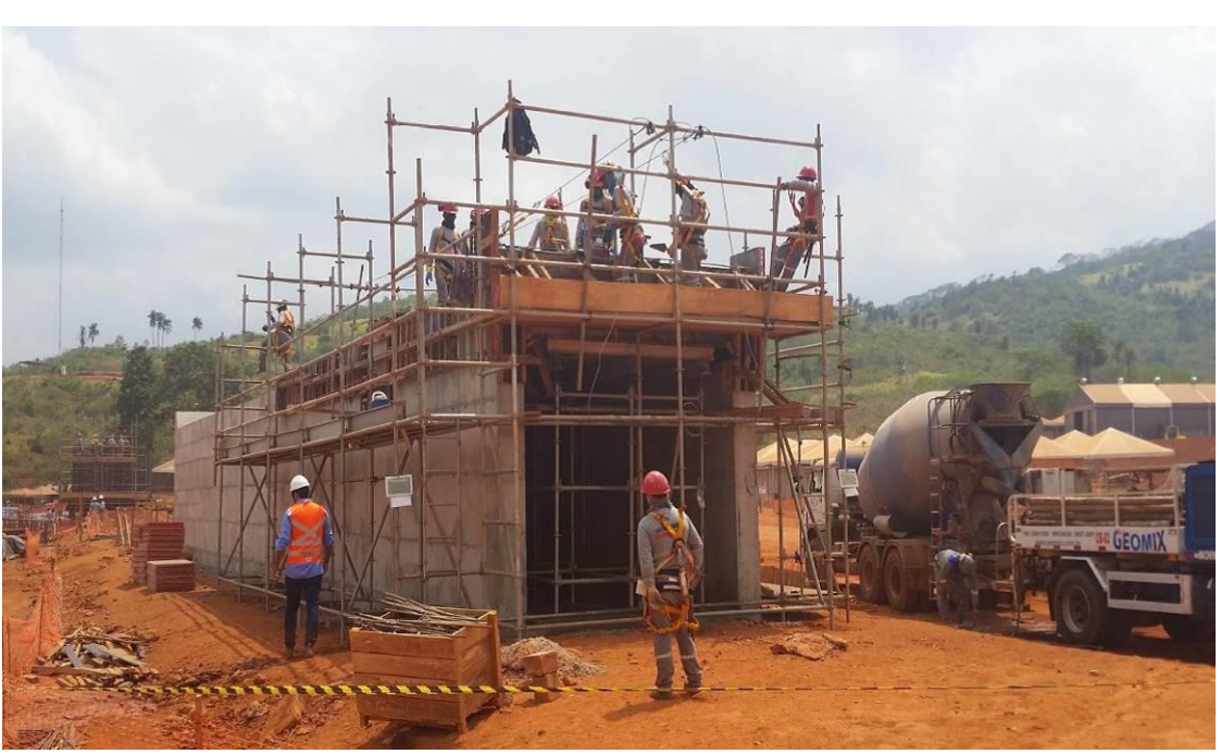
The Ball Mill feed reclaim tunnel civils are completed