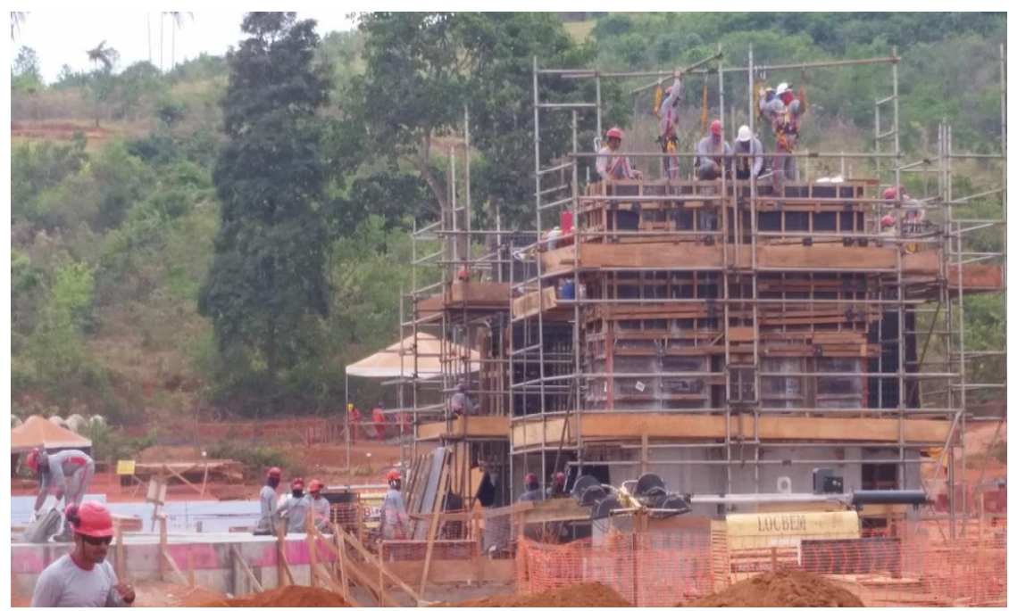
Installation of the Ball Mill concrete foundation represents the most complex civil works of the project. This activity has now reached the trunnion pedestal elevations where precision is paramount