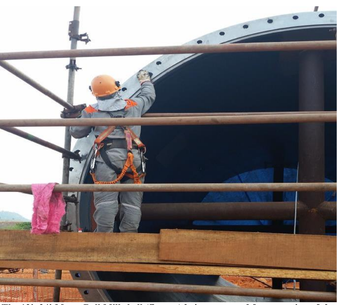
The 12'x24' Metso Ball Mill shell (flanges) being prepared for mounting of the trunnion heads