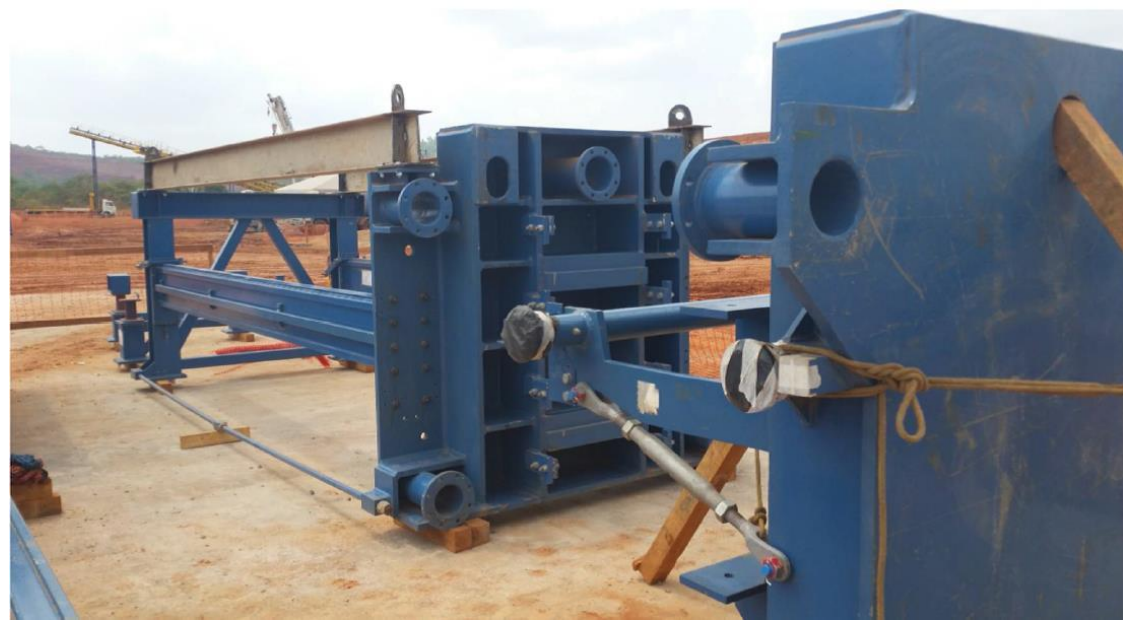
Metso VPA plate and frame pressure filter main assembly ready for installation within the building