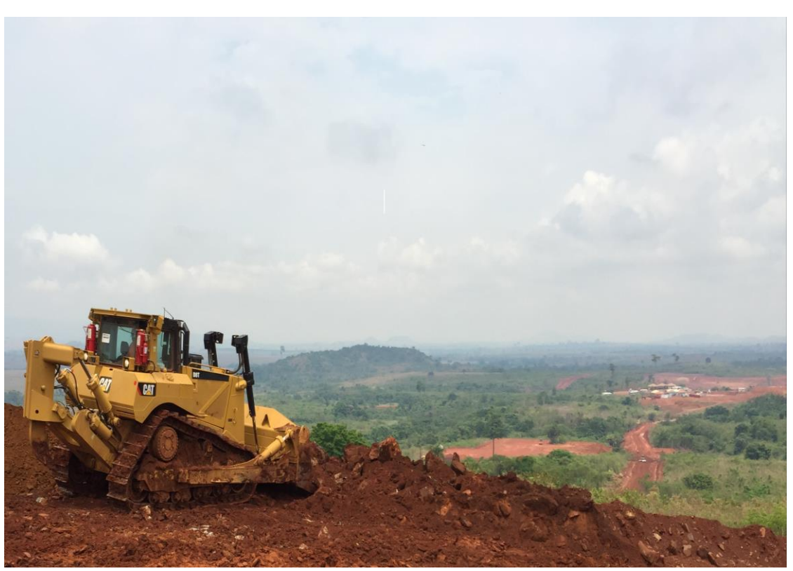
MACA's D8 Dozer pushing the haul road forward toward the plant in the distance