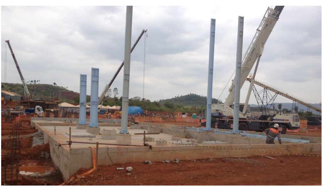
Flotation floor civils are sufficiently advanced to allow the start of structural steel which will support the float cells