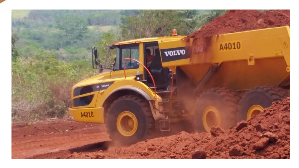
The articulated trucks are considered ideal for the Antas pit. This selection of equipment has already proven itself (with MACA) to operate well in mining and climatic conditions far more challenging than the Carajas.