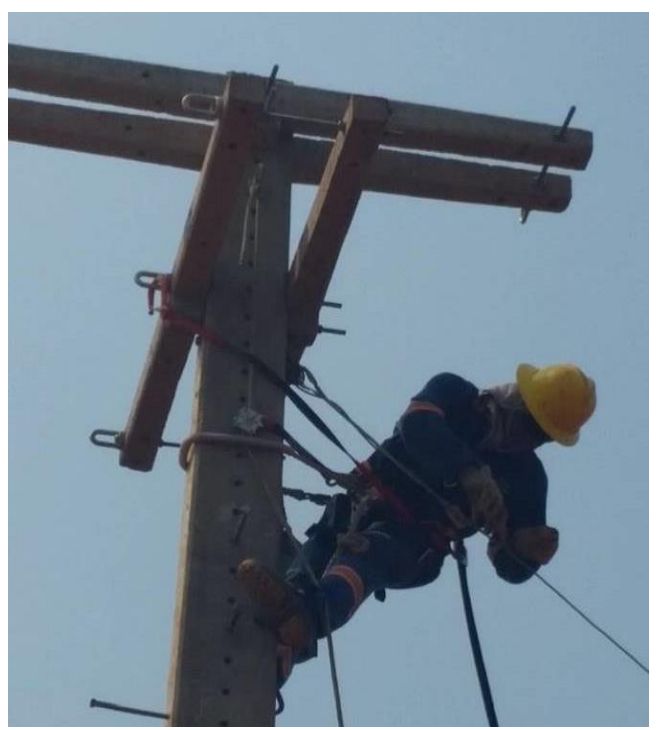
34.5Kv power cables being installed on the transmission poles