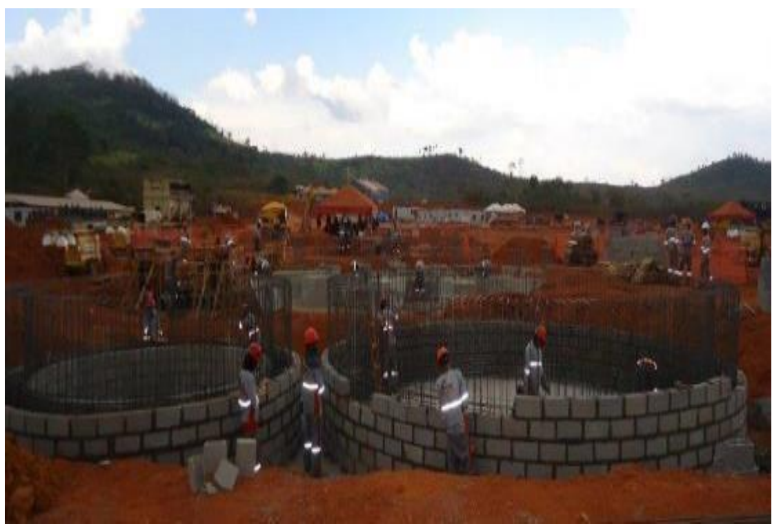
Foundations being prepared for Process water and raw water Tanks