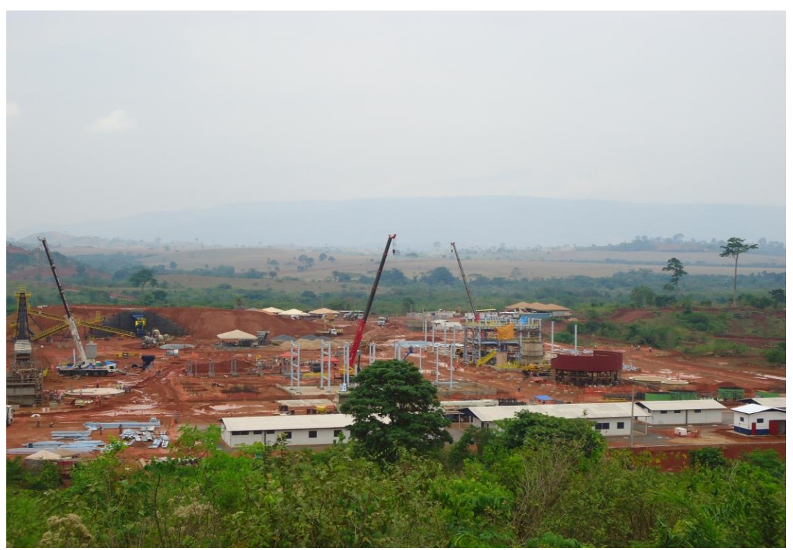
View of construction activities around the beneficiation plant