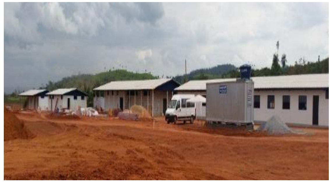
Admin offices, refectory and first aid post, all well advanced