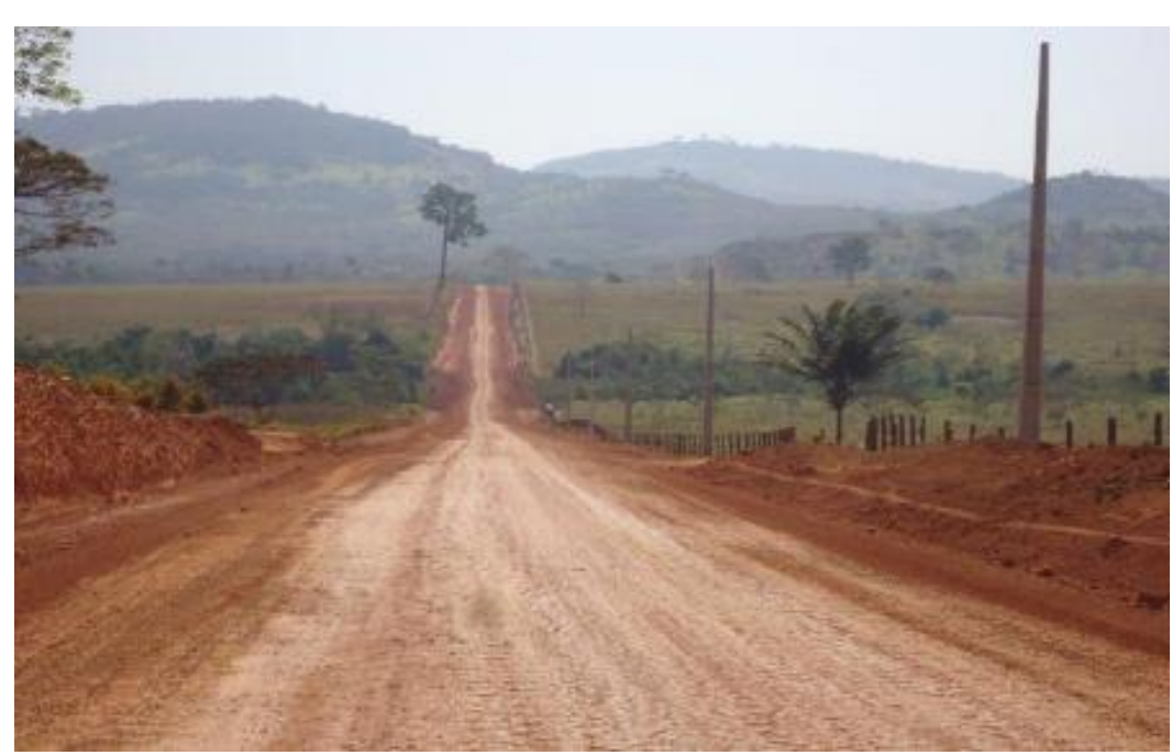
The mine access road including construction of a number of river bridges is ongoing. These are expected to complete before the wet season