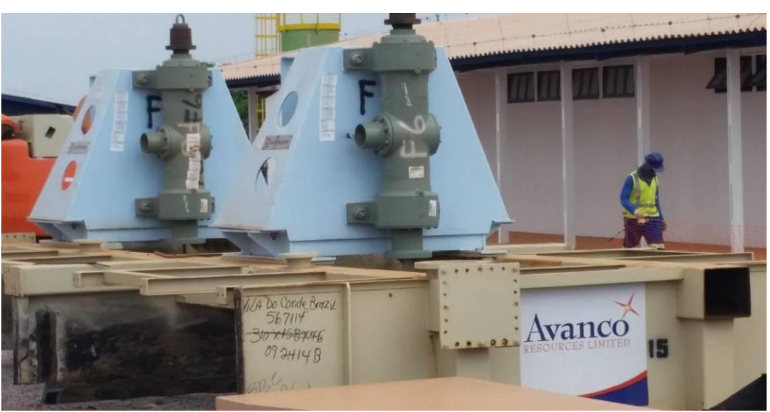
Rougher-Scavenger OK 38's Flotation Cells ready for lifting into position once the steel structures are ready