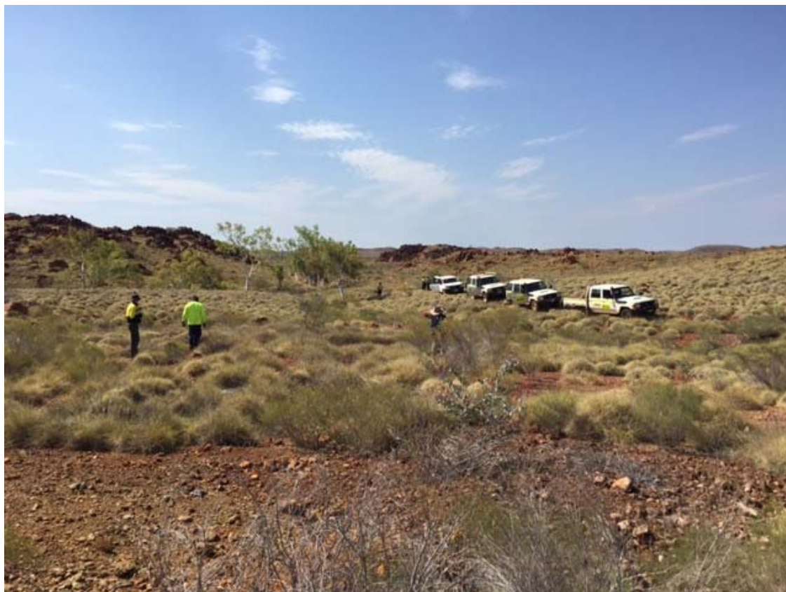
Figure 2. West Pilbara Heritage Survey – 27 October 2015