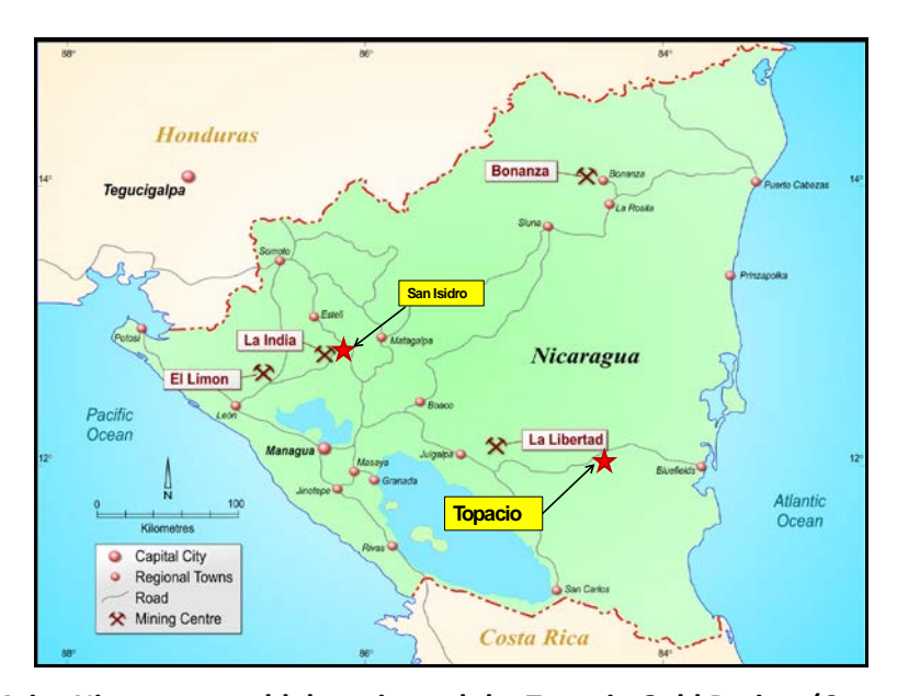
Figure 1 Major Nicaraguan gold deposits and the Topacio Gold Project (Central America)

Work programs have been agreed for the Minimum Commitment phase, with planning now well underway. While initial preparation will commence immediately, activities are scheduled to accelerate at the commencement of 2016.