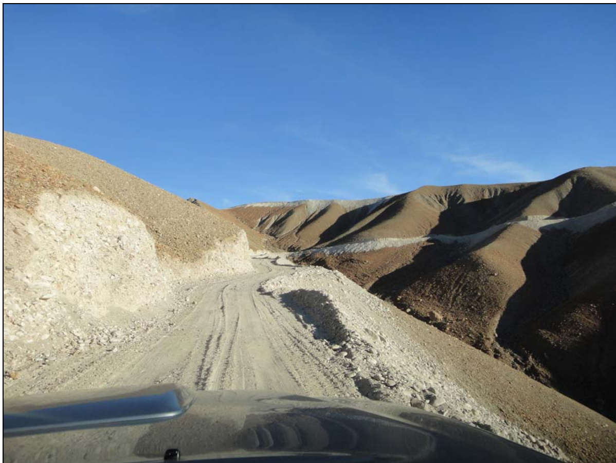
Lana Prospect: Access preparations for diamond drilling program