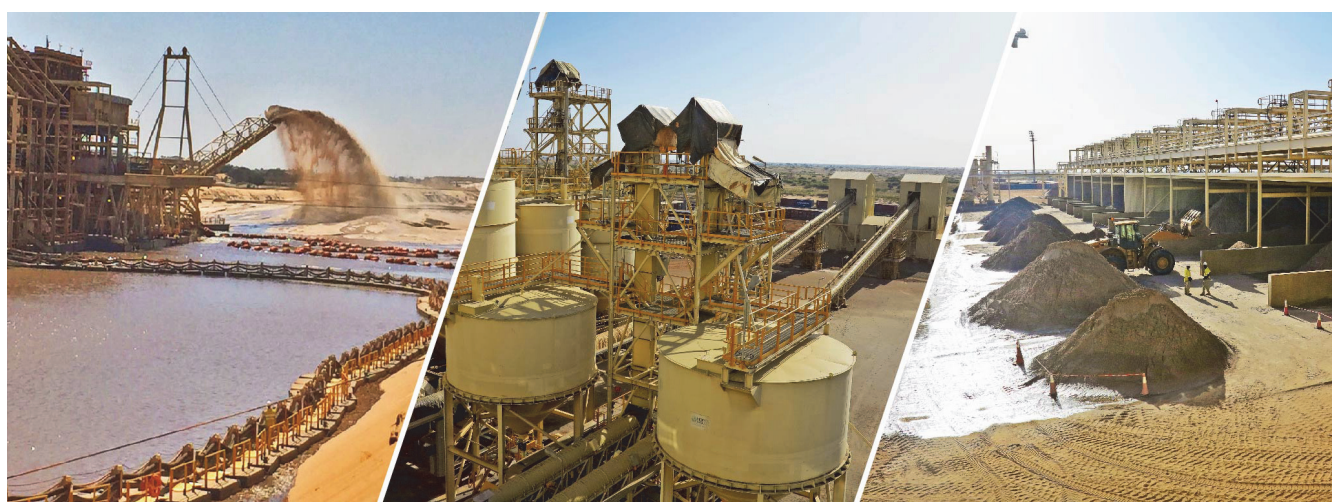
Grande Côte Operations, Senegal, West Africa

The strong performance from both a sales and production point of view enabled GCO to achieve a positive EBITDA result for each month of the quarter, extending its record of positive EBITDA on a monthly basis to five consecutive months from August to December. This is a significant achievement given the near record low prices being experienced in the mineral sands industry.