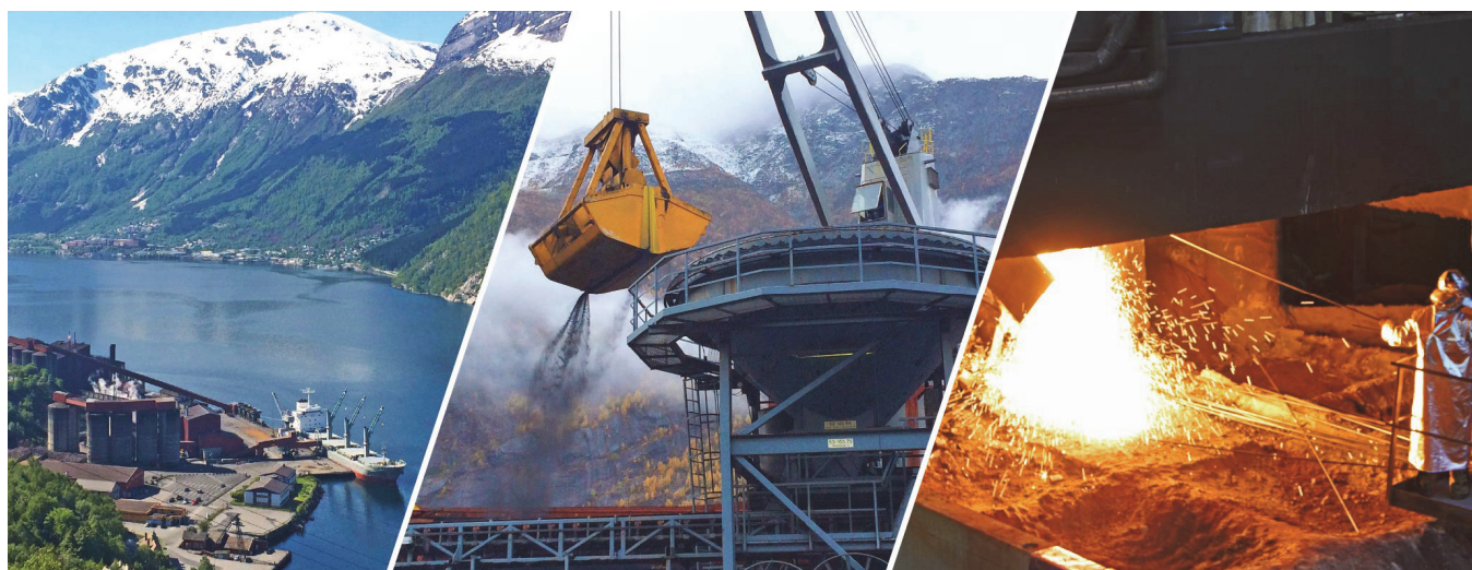
TiZir Titanium & Iron ilmenite upgrading facility, Tyssedal, Norway