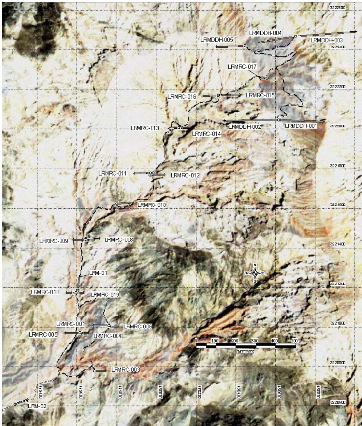
Figure 3: Koh-i-Sultan drillhole collar locations and drill traces – 2005 (LRM-01 – 02), 2008 (LRMDDH-001 – 005) & 2012 (LRMRC-003 – 019).

In early 2012, a 17-hole reverse circulation (RC) percussion drilling program totaling 2,070 m was undertaken within an area approximately 1,000 m east-west by 1,500 m north-south, along Miri Nala, southwest of Nawah Caldera (Figure 2). Drillhole collar location and hole traces are shown in Figure 3 below.