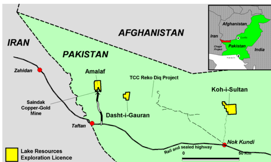
Figure 1: Location and tenement map.

A condition of the new licences is that the Balochistan Government should have up to a 25% interest in the licences – the government previously advised that preparation of a draft agreement was under way.