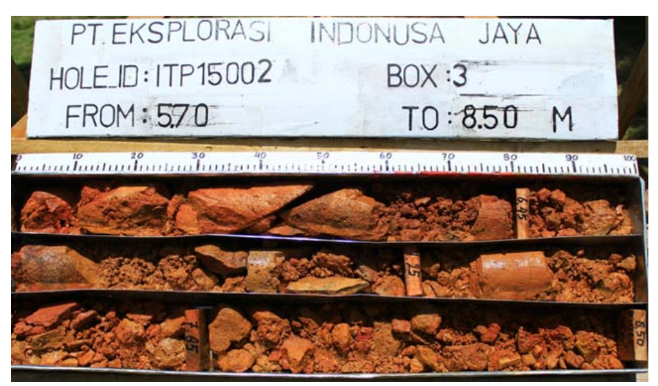
Drill core from Tapadaa drill hole ITP15002. Intensely oxidised vuggy quartz grading 0.63 g/t gold over the interval 5.0 to 9.0 metres is shown.

During the half year scout drilling at the Lombongo prospect area at Tapadaa suggested the potential for a near surface, oxide gold resource. In order to better evaluate the amenability of the oxide material to standard cyanide leach processing, the Company had bottle roll leach tests completed for selected samples of oxide material taken from both Lombongo drill holes.