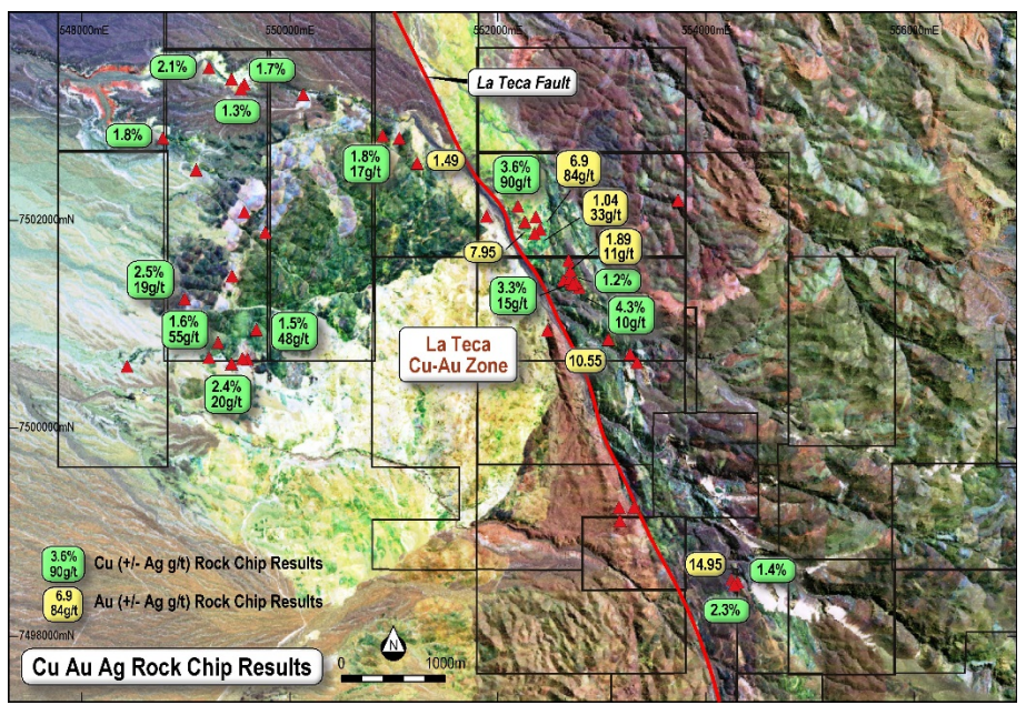
Figure 3 La Teca gold copper results

In previous ASX releases the company presented the discovery of high grade copper, gold and silver mineralisation at its La Teca prospect. Figure 3 presents these results. This is a totally new style of mineralisation and is characterised by quartz veining, and pervasive propylitic alteration of the host andesites. A number of potassic altered intrusive porphyry stocks have now been mapped and the mineralisation is interpreted to be related to a porphyry copper system at depth.