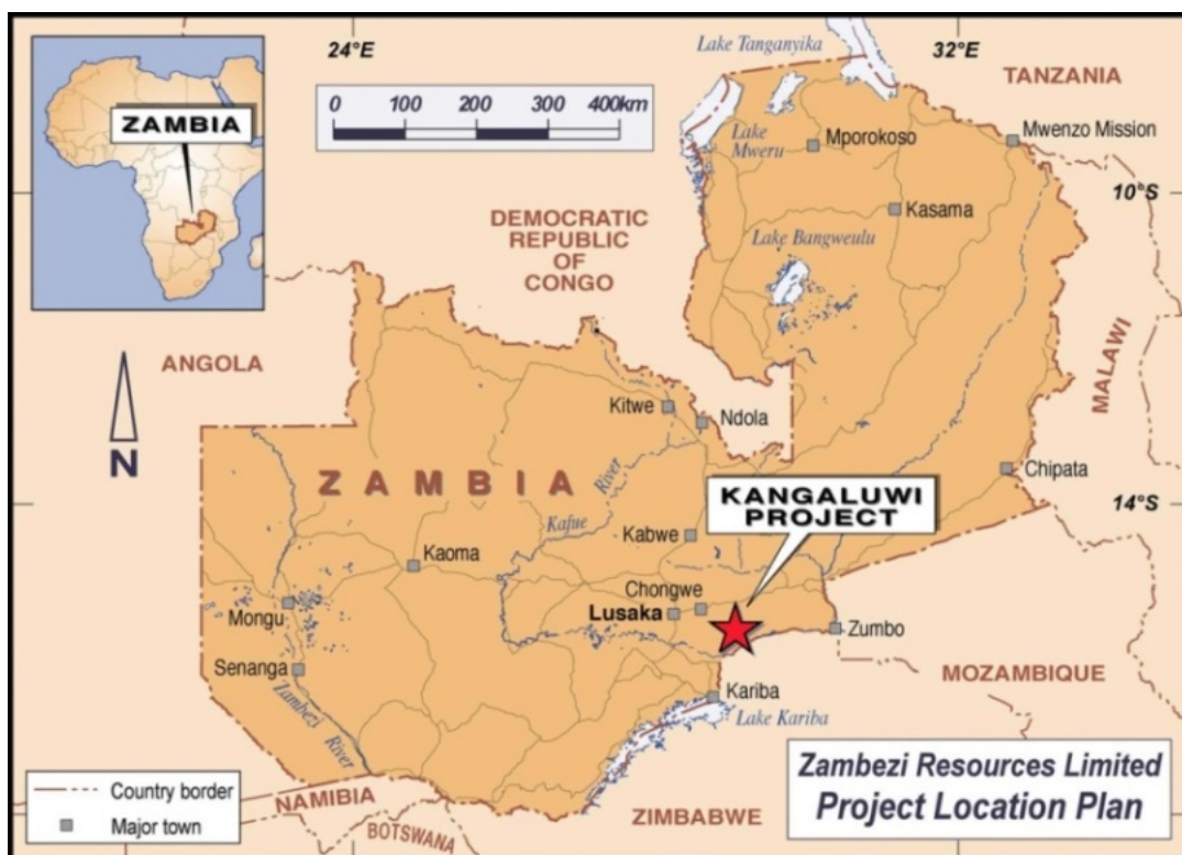
Figure 1: Kangaluwi Project Location Map