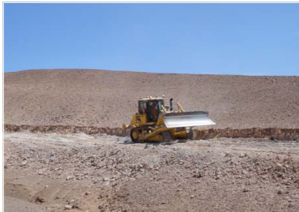
Drill access preparation at Puite