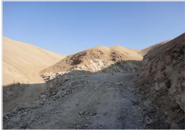
Cardonal Prospect — Drill Hole CAR05