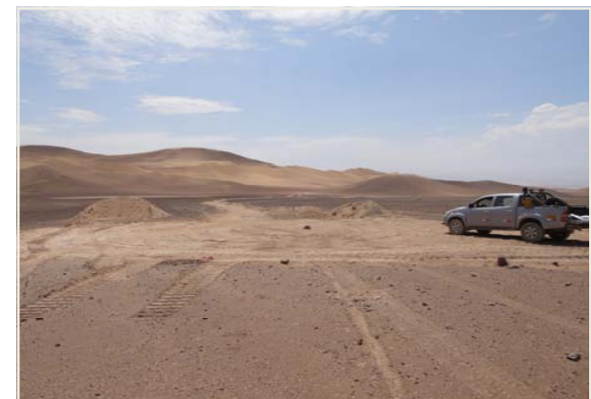
Puite Prospect — Drill Hole PUT05