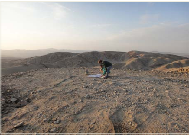
Cardonal Prospect — Drill Hole CAR01