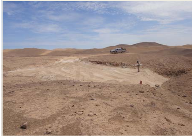
Puite Prospect — Drill Hole PUT03