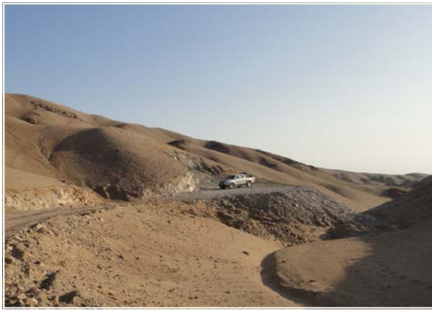
Cardonal Prospect — Drill Hole CAR02