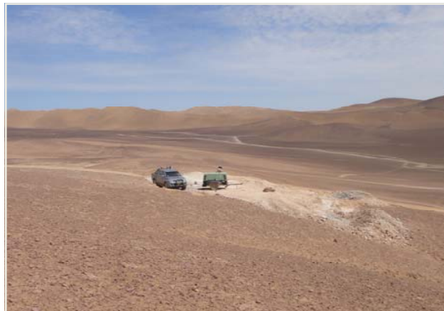
Puite Prospect — Drill Hole PUT02