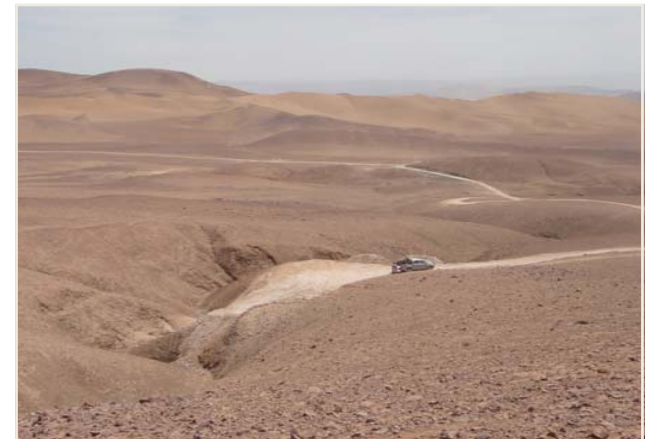
Puite Prospect — Drill Hole PUT01