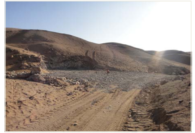
Cardonal Prospect — Drill Hole CAR04