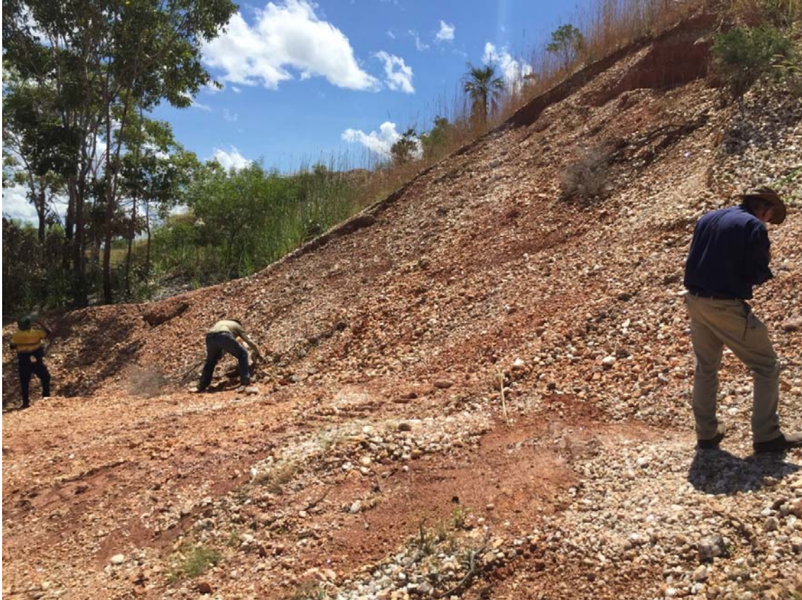
Figure 1. Core staff and consultants evaluating and sampling waste dumps Mt Finniss Mine.

North America. CSA has experience in all stages of the mining cycle from project generation to production.