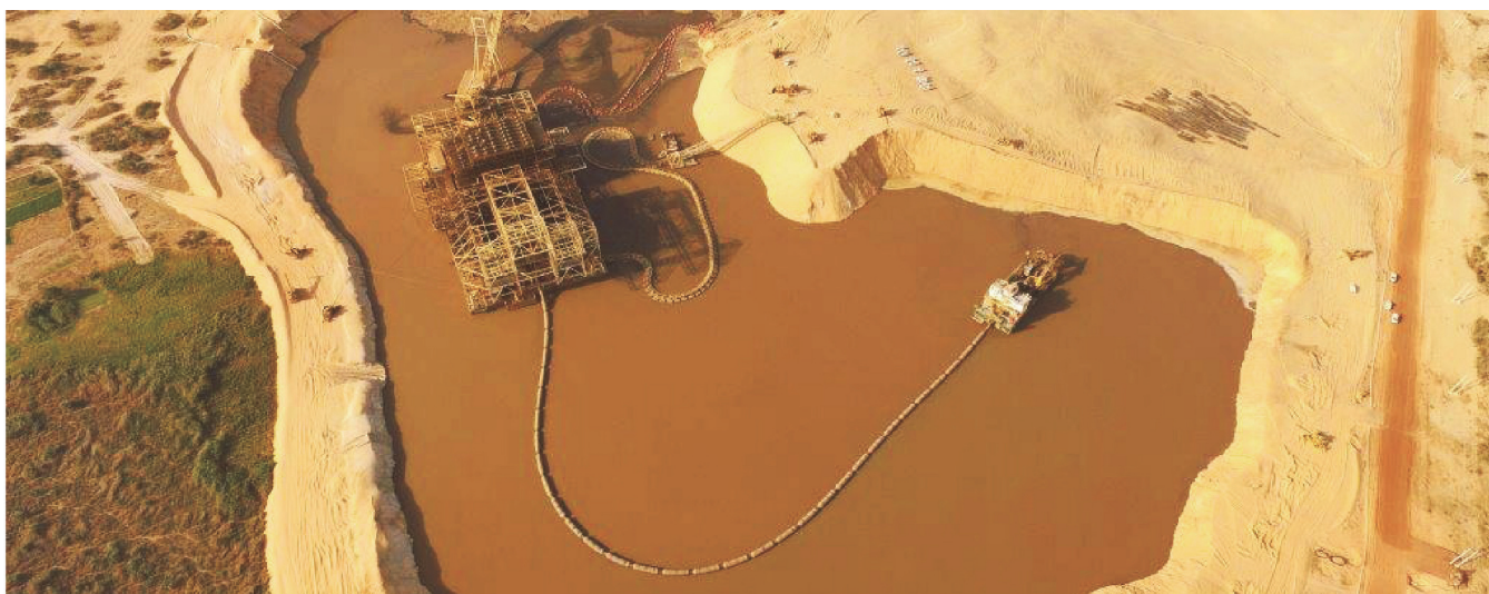
Mine path turnaround at Grande Côte Operations, Senegal, West Africa

During February and March, the dredge and wet concentrator plant reversed course to move south along the dune system. As this was the first 180 degree turn for the plant since operations commenced, throughput was restricted. However, the manoeuvre provided an opportunity to optimise the dredge automation system, tails deposition procedure and anchor positioning plans which will reduce the impact of future turnarounds.