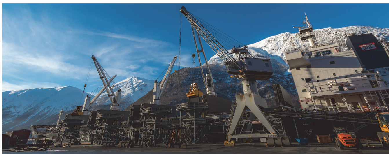
First chloride slag shipment from TiZir Titanium & Iron ilmenite upgrading facility, Tyssedal, Norway