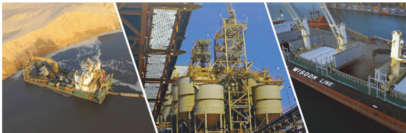
Grande Côte Operations, Senegal, West Africa

Lower production and sales volumes in February 2016 halted GCO's run of consecutive months of positive EBITDA. GCO is continuing to work towards significantly reducing costs and improving the efficiency of its operations in order to improve profitability whilst enduring near record low prices in the mineral sands industry.