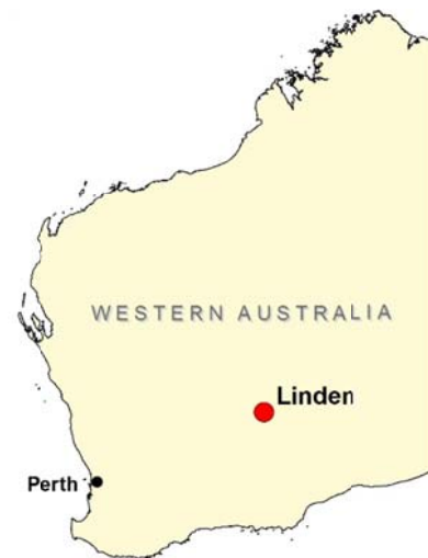
Location of the WA projects.

Historic sampling of quartz-pyrite altered rocks from local waste dumps recorded grades of up to 16 g/t Au. Linden (Good Hope) is located in the Linden mining district some 120 km southeast of the town of Leonora.