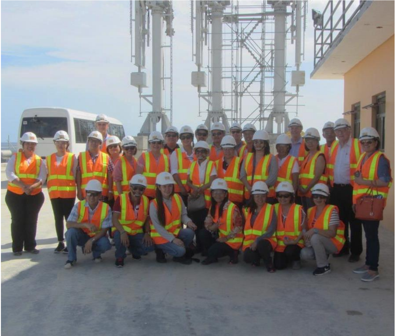
Department of Energy and House of Representatives (Government) Site Visit