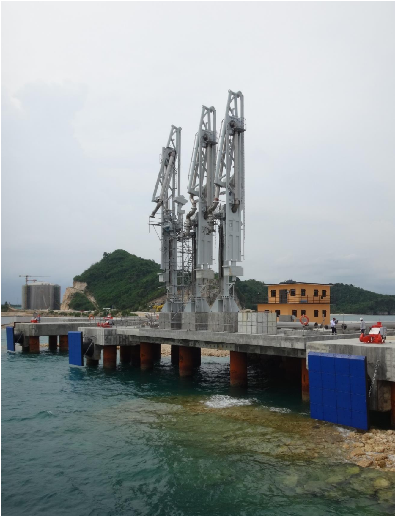
Quick Release Hooks and Fenders Installation Completed