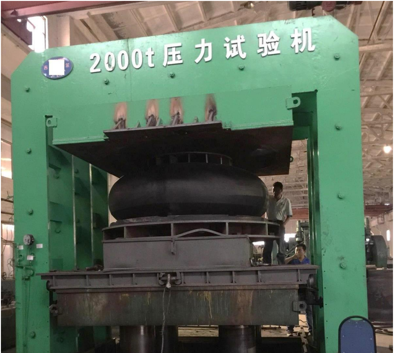
Fenders Factory Compression Test