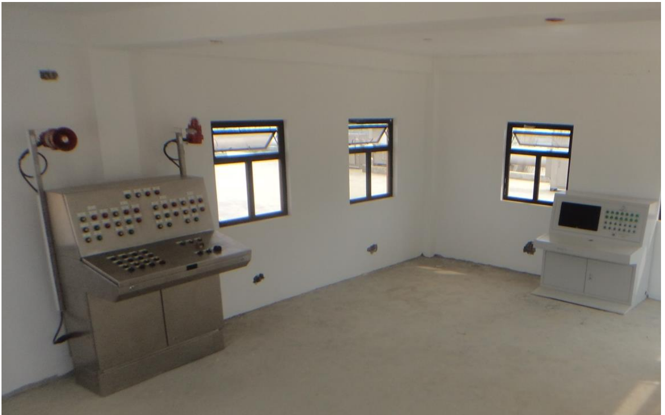
Inside Control Building