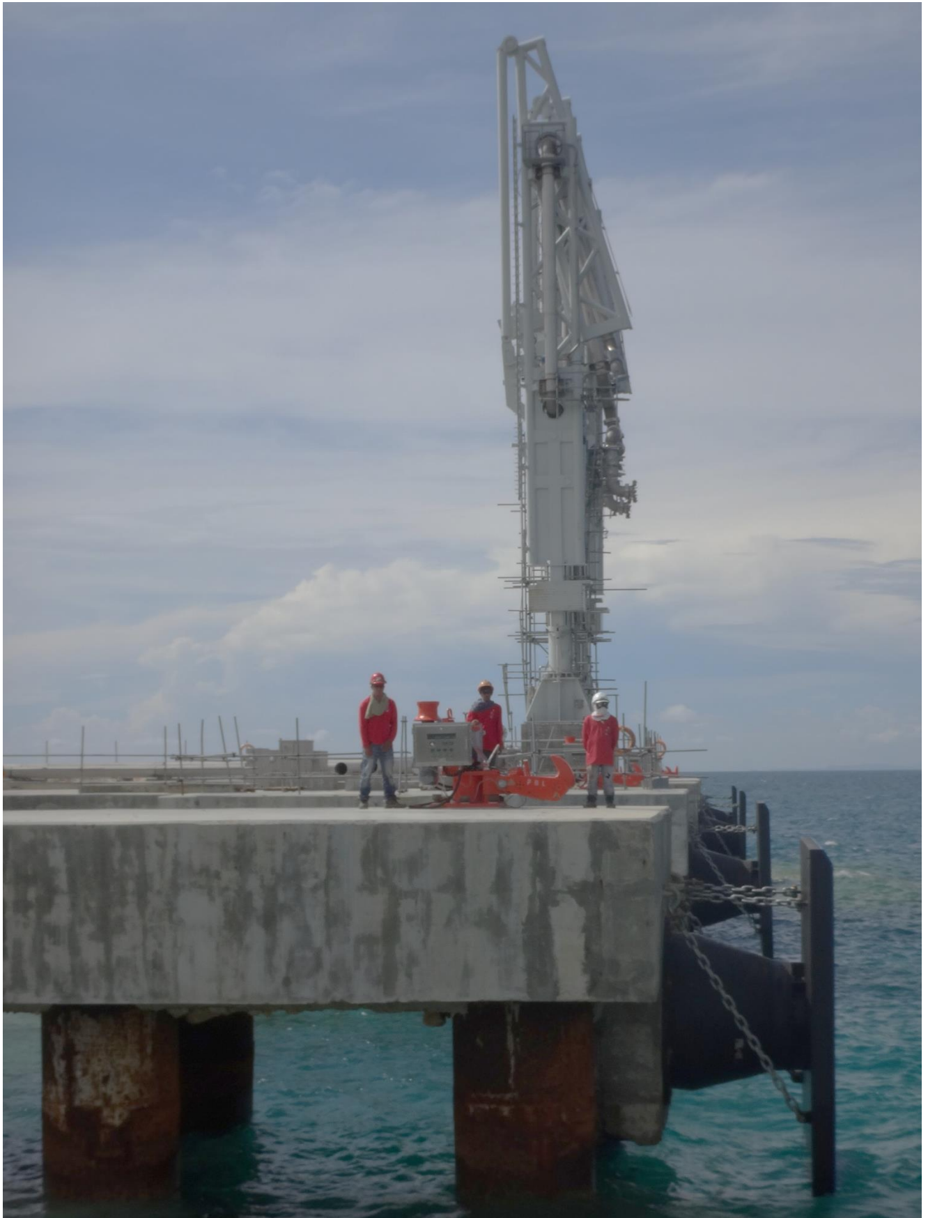
Quick Release Hooks and Fenders Installation Completed