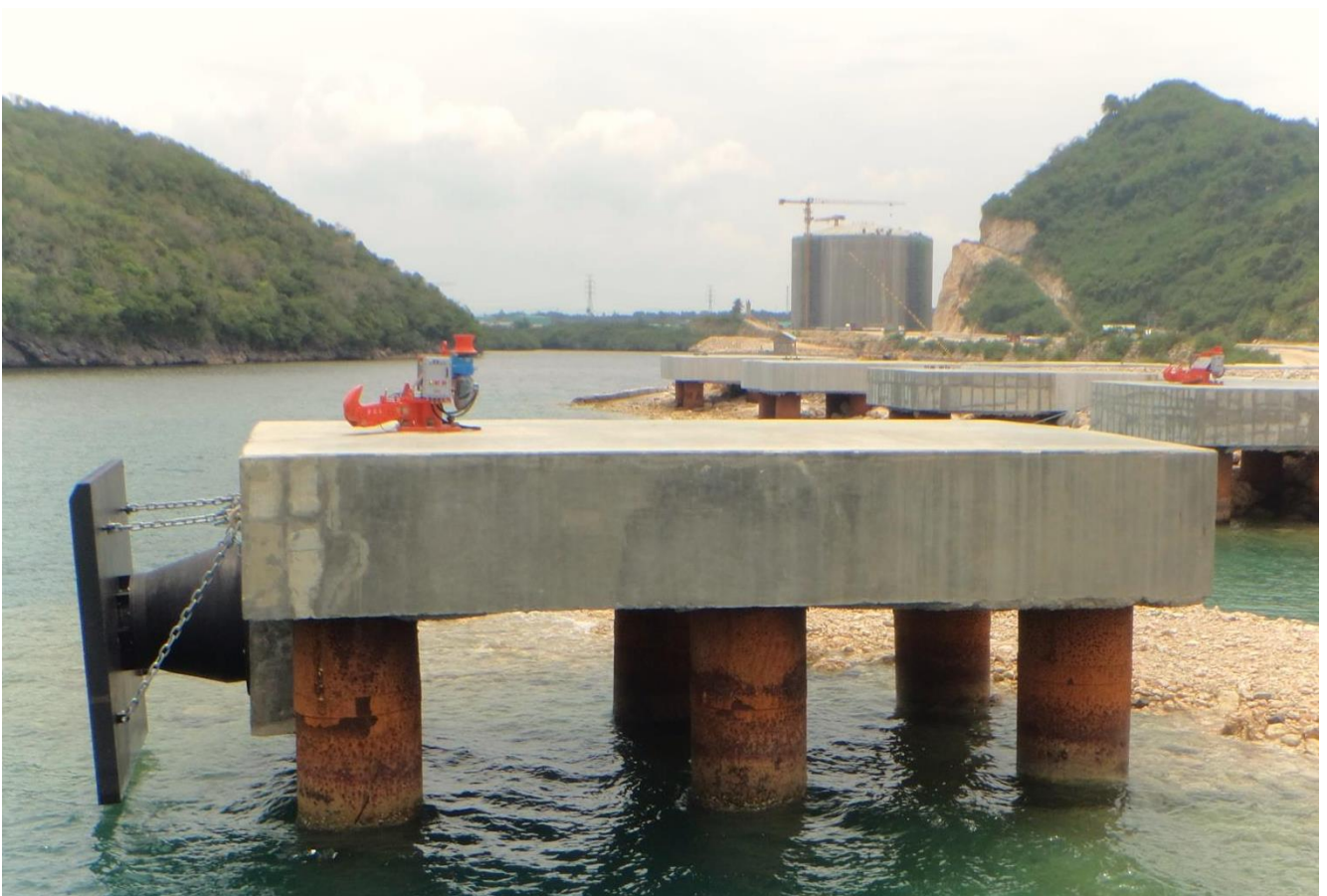
Installation of Fender