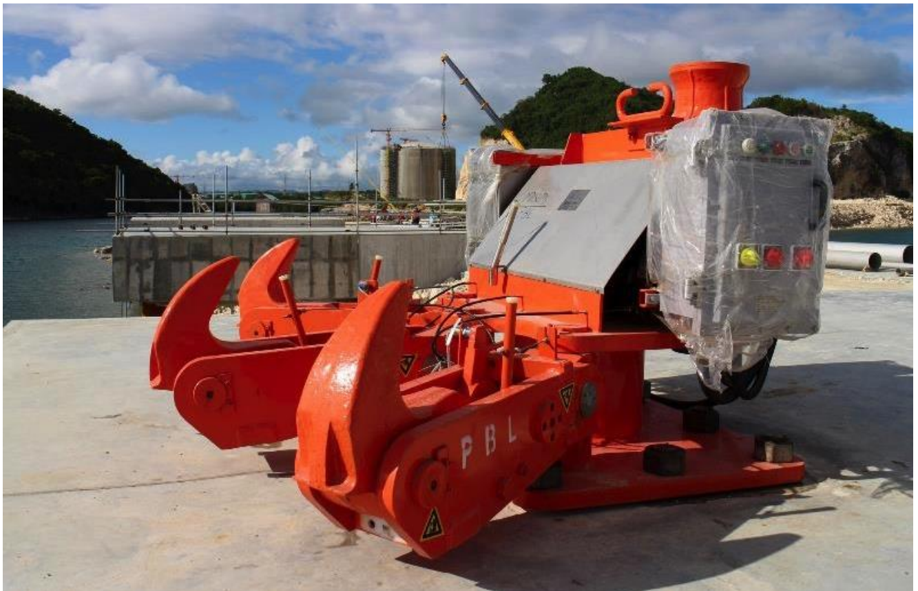
125 Tons Triple Quick Release Hooks Installed at Mooring Dolphin