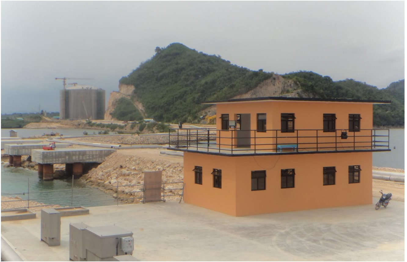
LNG Jetty Control Building