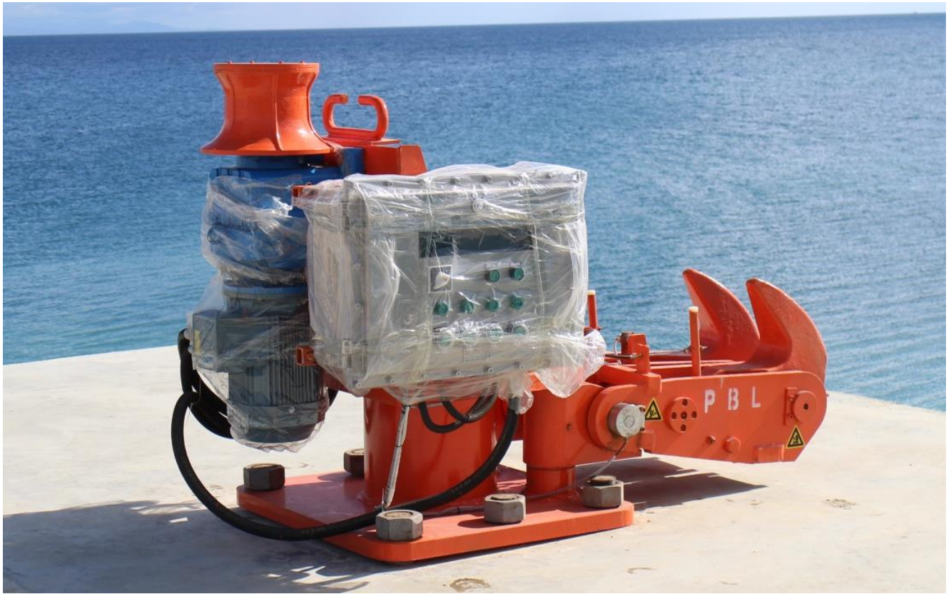
100 Tons Double Quick Release Hooks Installed at Berthing Dolphin