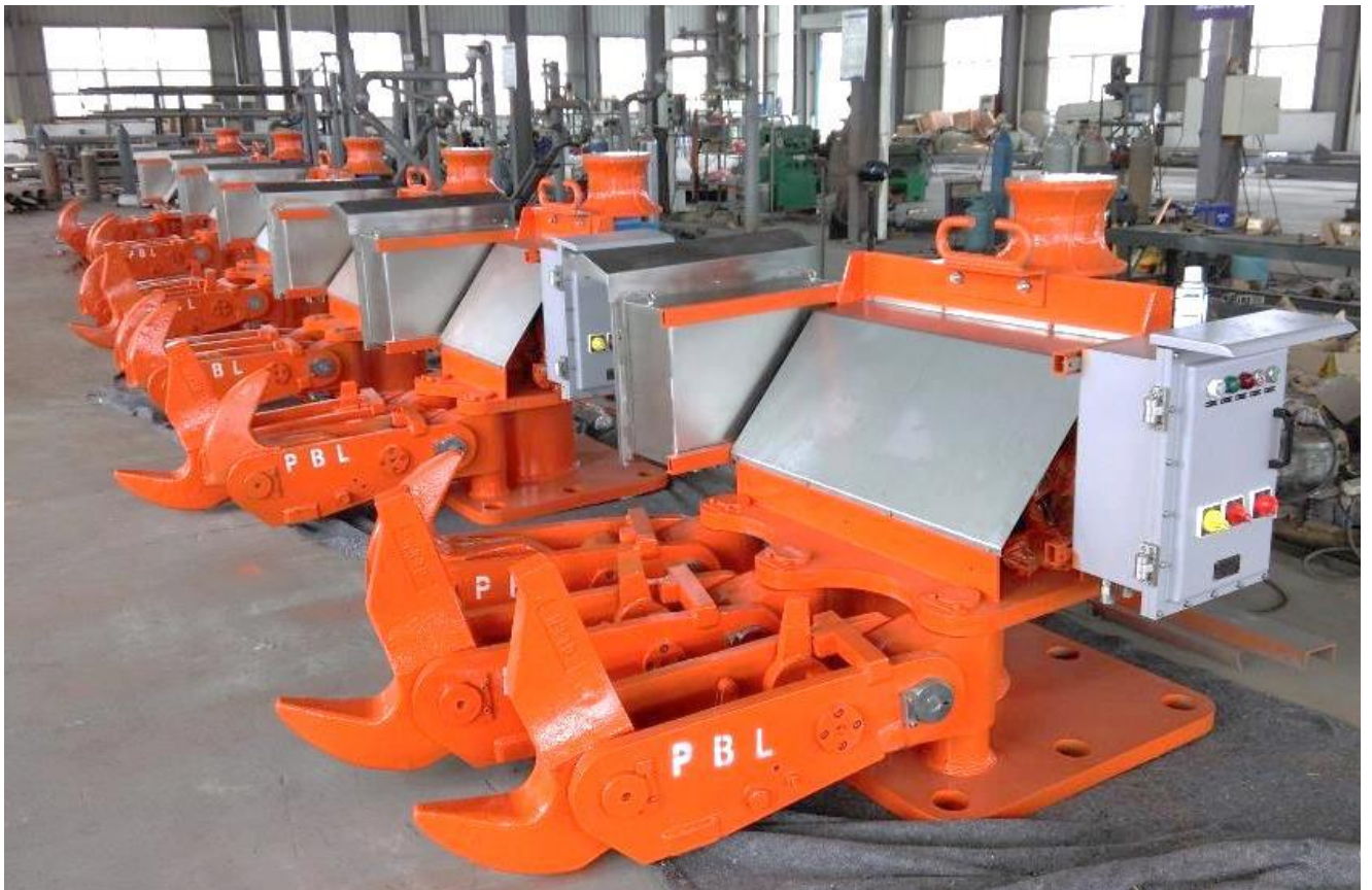
FAT Completed & Ready for Shipment