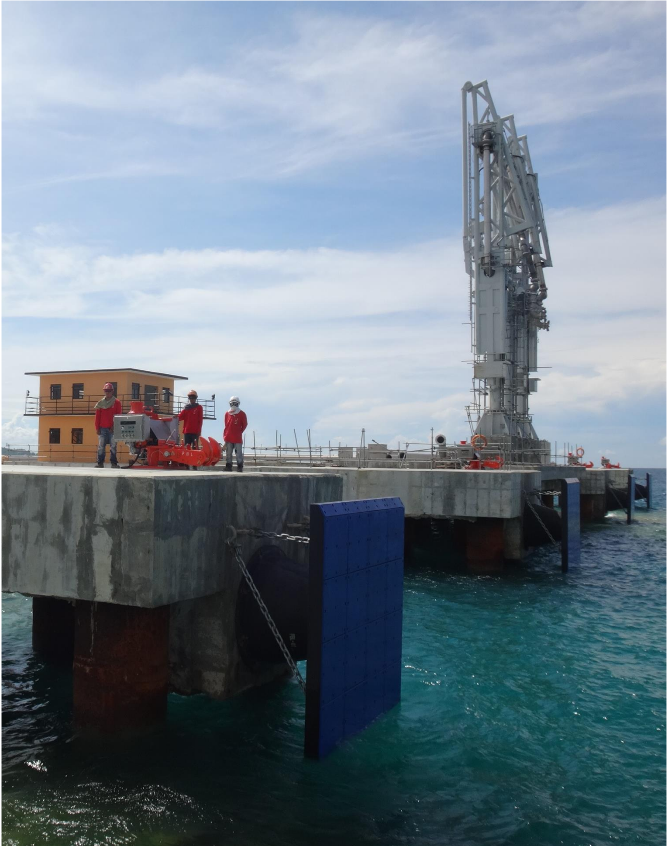
Quick Release Hooks and Fenders Installation Completed