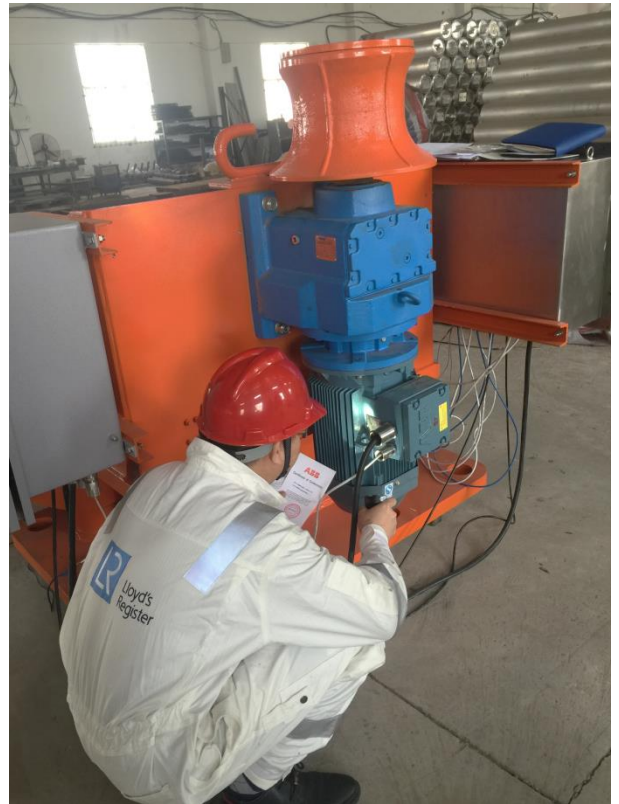
Quick Release Hooks Factory Acceptance Test