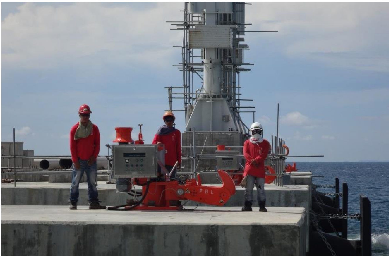
Quick Release Hooks Installation and Testing