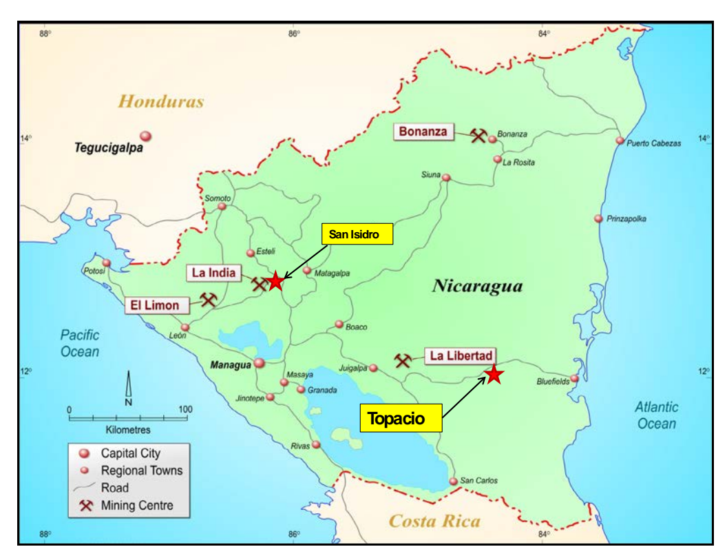
Figure 1 Major Nicaraguan gold deposits and the Topacio Gold Project

will be critical in defining drill targets to test the extent of the low sulphidation epithermal system and hence expanding the existing Topacio gold resource."