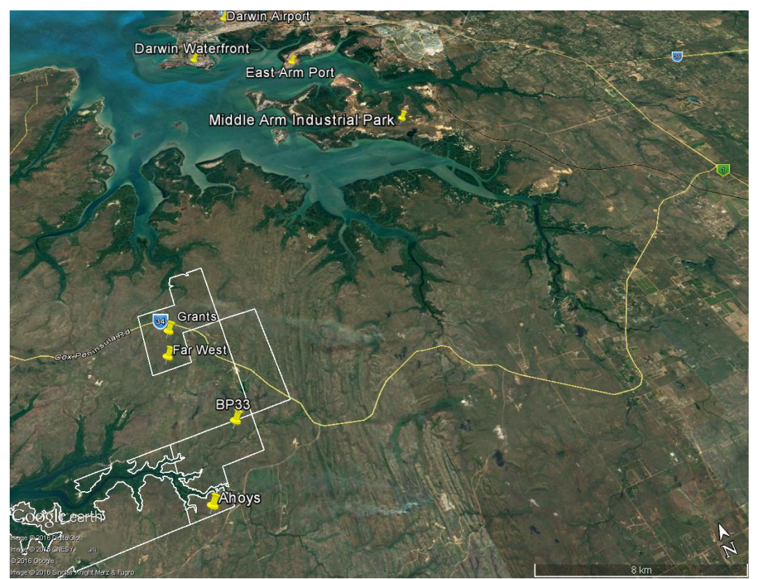
Figure 2. Initial drill targets locations on EL 29698 Finniss Lithium Project near Darwin NT

A 26 Gray Court, Adelaide SA 5000 | T (08) 7324 2987 | E info@coreexploration.com.au www.coreexploration.com.au