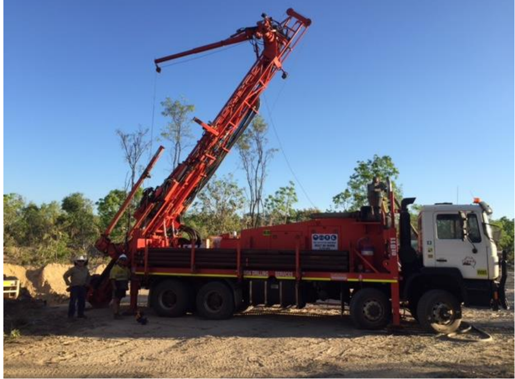
Figure 1. RC Drill rig at BP33, Finniss Project, NT