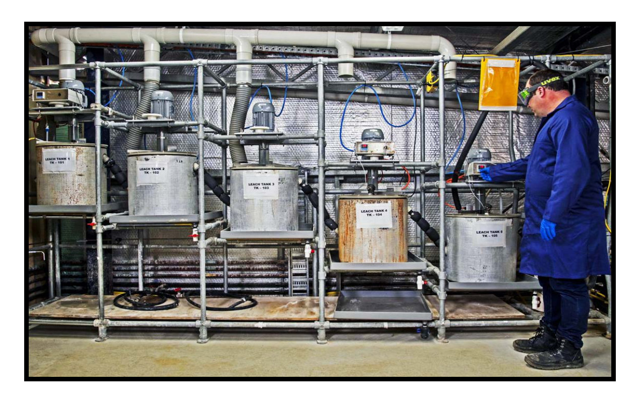
Figure 1: Sileach™ continuous pilot plant operation, ANSTO Minerals, Lucas Heights, NSW.

Extraction of lithium in the Sileach™ process exceeded 95% in the leach circuit, validating both the overall extraction and accelerated rate of extraction of lithium achieved in the laboratory test work program. The performance in the impurity removal circuits was comparable with the laboratory test work program, producing a liquor suitable for further processing. The operation of the pilot plant was robust and provided valuable materials handling and additional engineering design data for Lithium Australia's Sileach™ process.