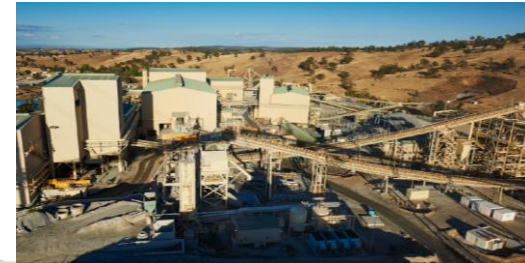
CADIA: Mill expansion to 32 mtpa +