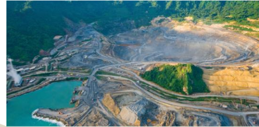
LIHIR: Target 13 mtpa +