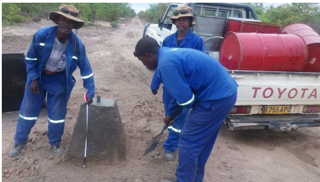
Beacon construction around the ML boundary

Demarcation of the licence boundary commenced in November following comprehensive consultations with stakeholders and public community meetings throughout October and November.