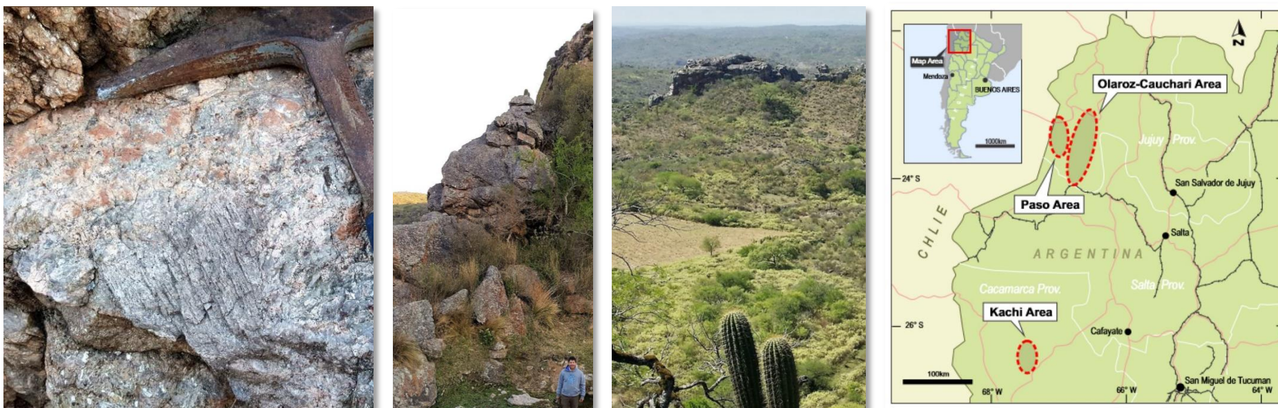
Figure 2: Spodumene crystals and large outcropping pegmatites in Ancasti; Other Lake Projects in Argentina