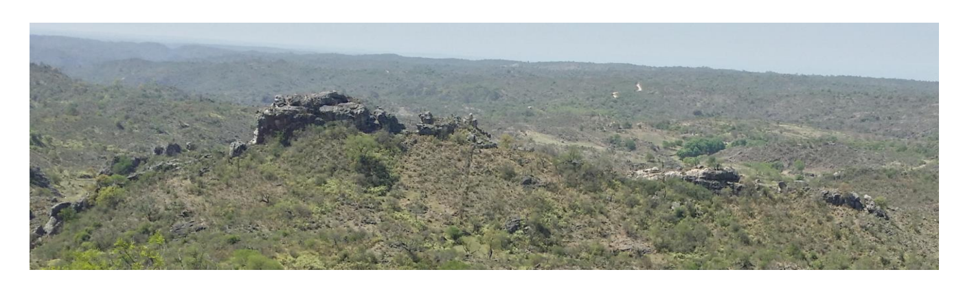
Figure 1: Large outcropping pegmatites with spodumene in Ancasti, Catamarca