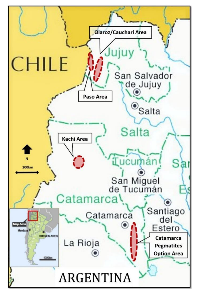
Figure 2: Location map of Lake Resources lithium brine projects (Olaroz/Cauchari, Paso, Kachi) and lithium pegmatite projects in NW Argentina