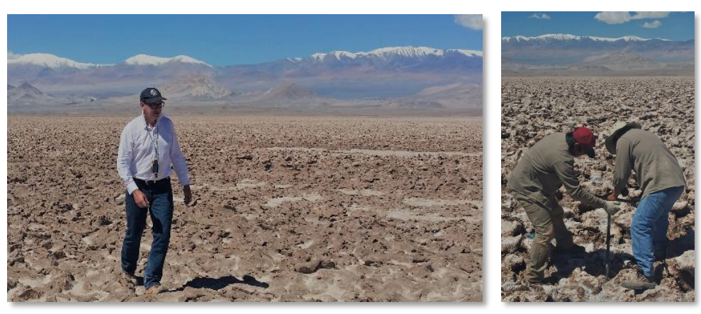
Figure 1: Kachi Lithium Brine Project - sampling

Significant corporate transactions continue in adjacent leases with development of Lithium Americas Olaroz/Cauchari project with a 28% equity investment of C$106 million, from Gangfeng, an important Chinese producer, and BCP Innovation and a US$205 million debt facility. Advantage Lithium announced a transaction to earn 65-75% equity in some of Orocobre's leases, including Cauchari, raising C$40 million in the market.