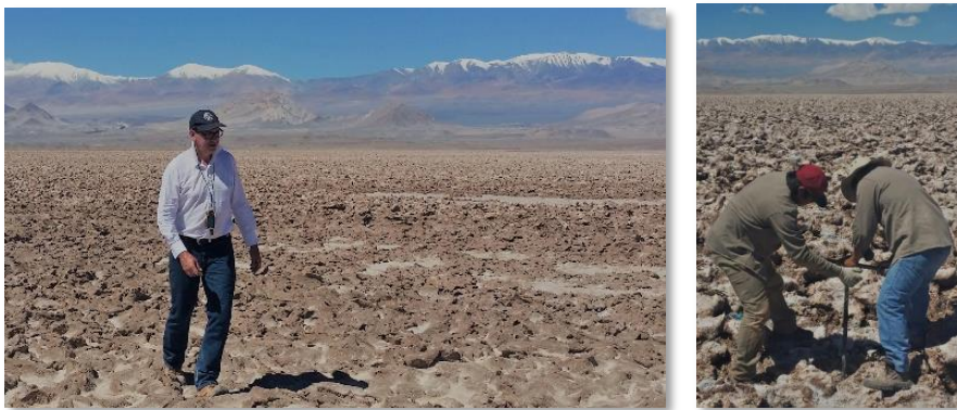
Figure 1: Kachi Lithium Brine Project – sampling