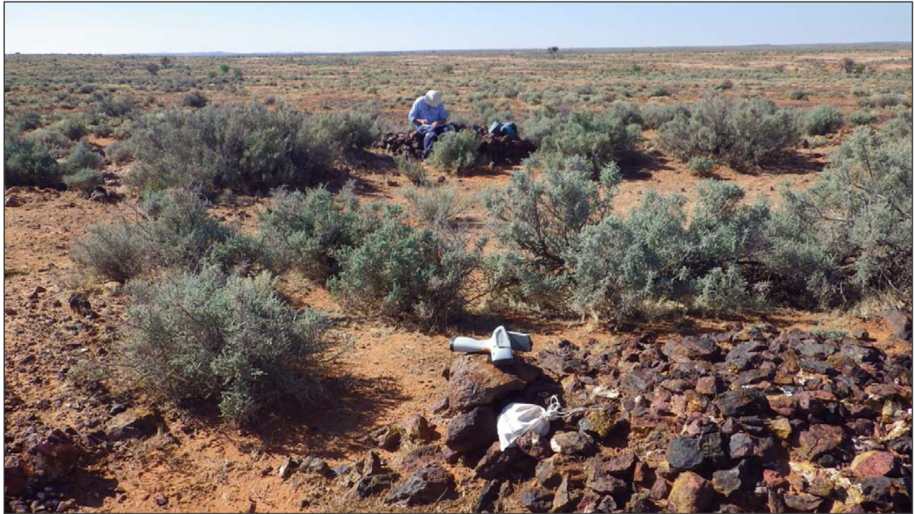
Area B Historical Prospecting Pit – one of four on a strong 600-metre-long EM trend