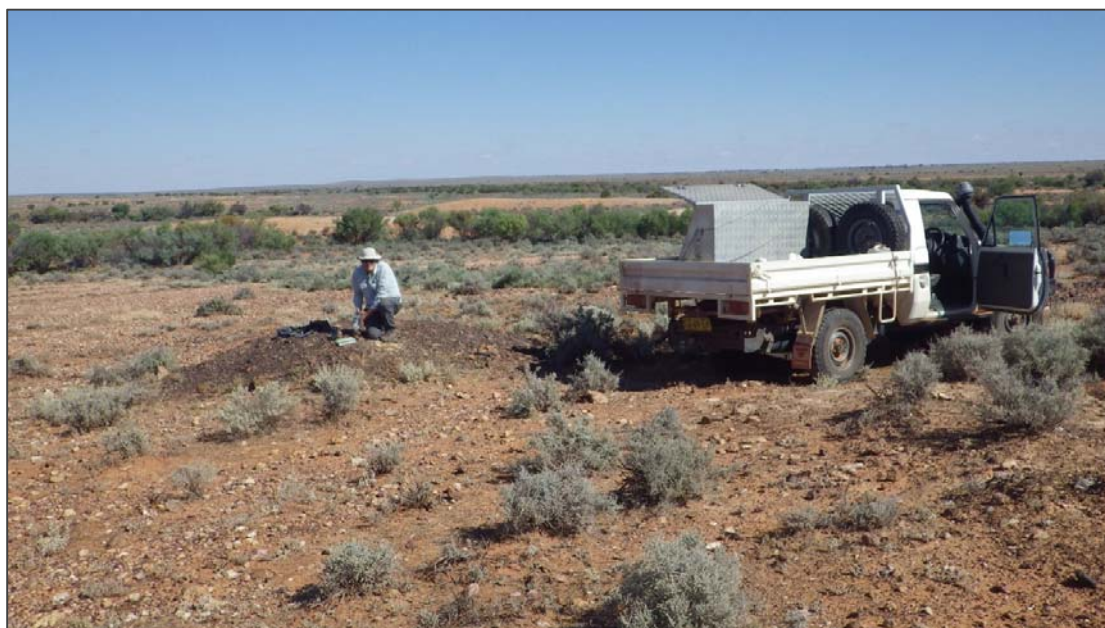
Area A Historical Prospecting Pit – part of a 400-metre line of workings on a strong EM trend