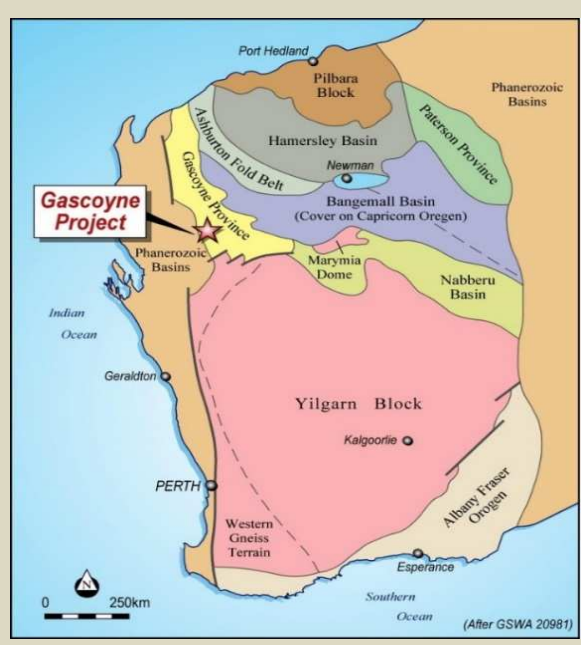
Figure 2: Gascoyne Project - Location Map

The Gascoyne Project covers an area of mid-Proterozoic aged, metamorphosed sediments and volcanic rocks which have been subjected to several phases of tectonic deformation and intruded by granitoids. Exploration work and drilling to date has used the geological model of base metal mineralisation being associated with coincident soil geochem and "thumbprint" magnetic anomalies. Historical RC drill testing from one of these targets has returned significant intercepts of 2.3% Pb and 0.9% Cu. Lead sulphide (galena) and copper sulphides (chalcopyrite) were identified in the drill chips.