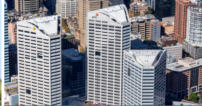
Darling Park 4, Sydney