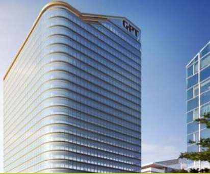
Corner 93-95 Phillip St & 32 Smith St, Parramatta