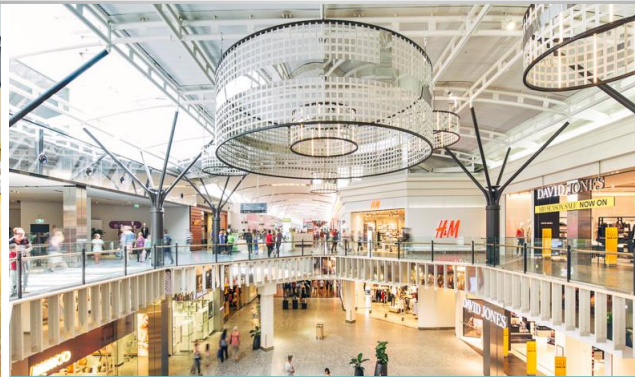
Macarthur Square Redevelopment