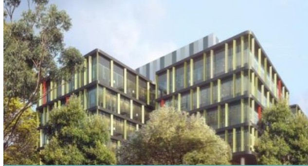
4 Murray Rose Ave, Sydney Olympic Park