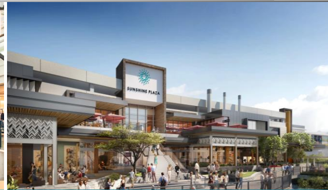
Sunshine Plaza Expansion