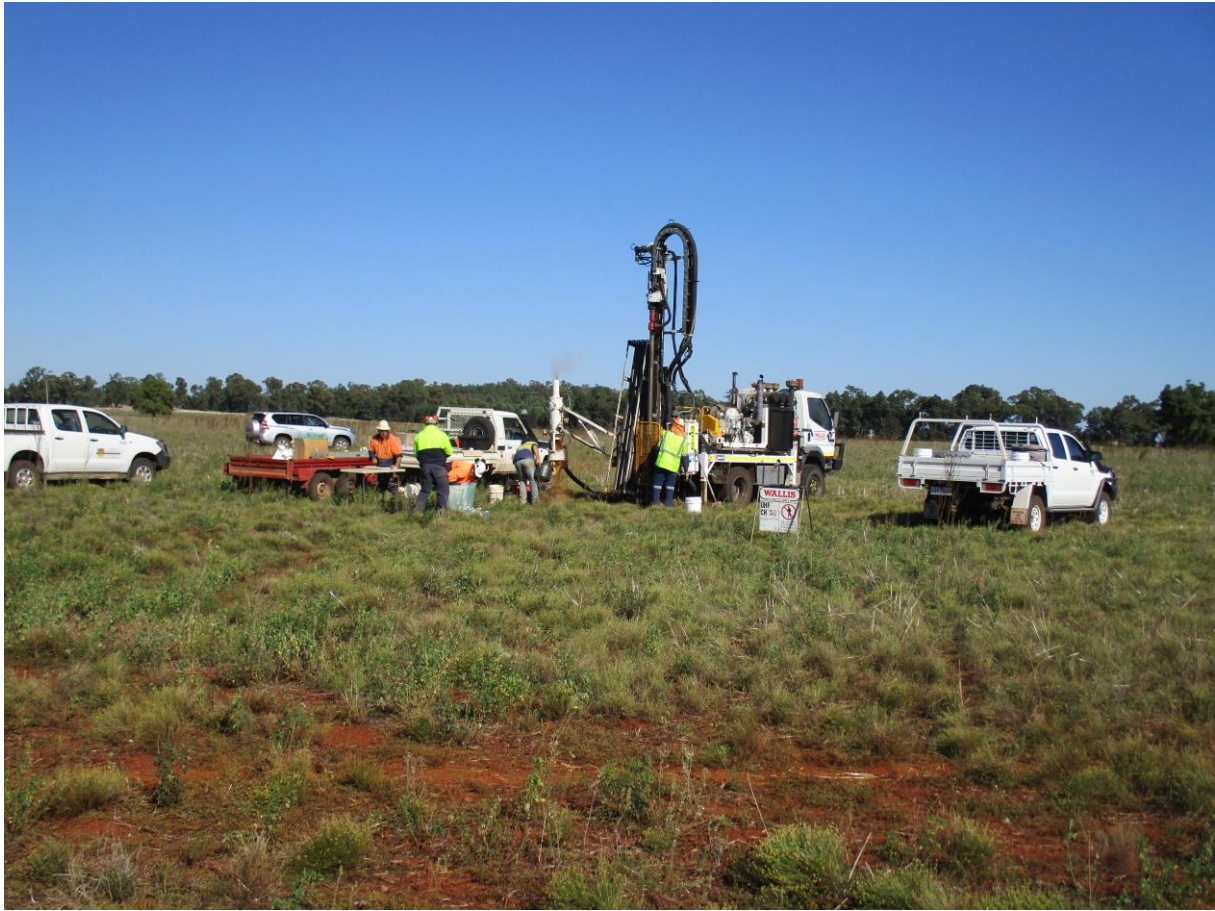
Figure 1: Australian Mines' resource extension drilling at its Flemington Cobalt-Scandium-Nickel Project has commenced. This program comprises 185 air core holes for an expected total of 5,500 metres to be drilled.